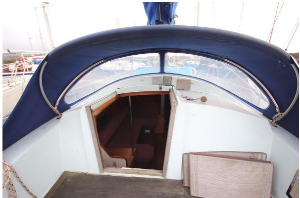
Nicholson 35 sprayhood