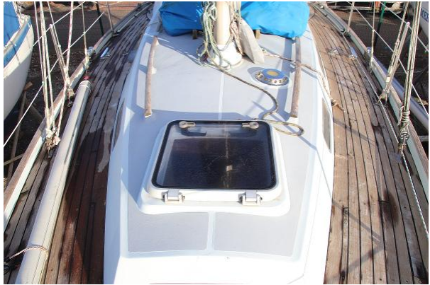
Nicholson 35 laid decks