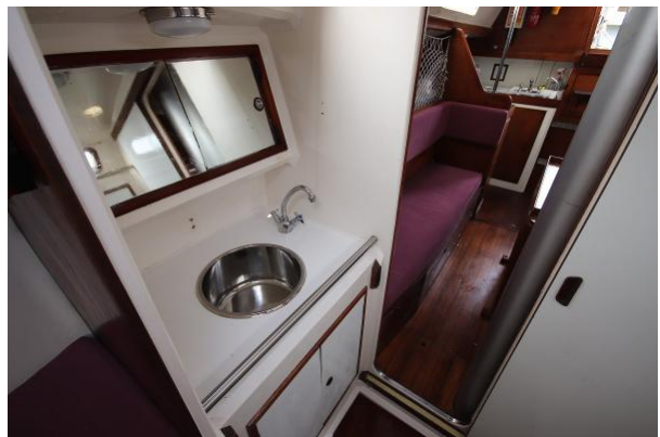
Nicholson 35 washbasin to starboard