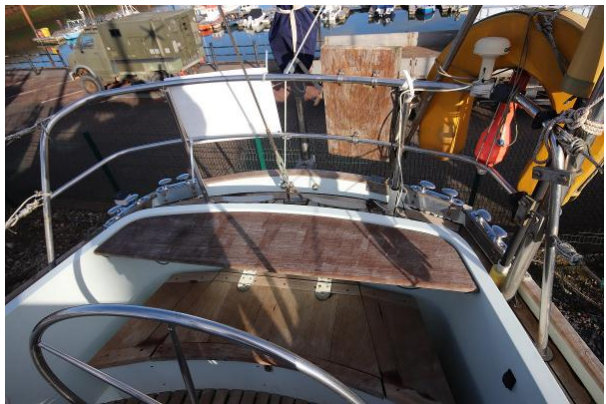
Nicholson 35 helm position