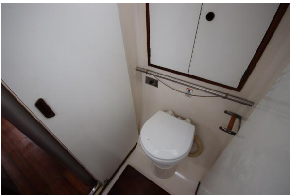
Nicholson 35 heads to port