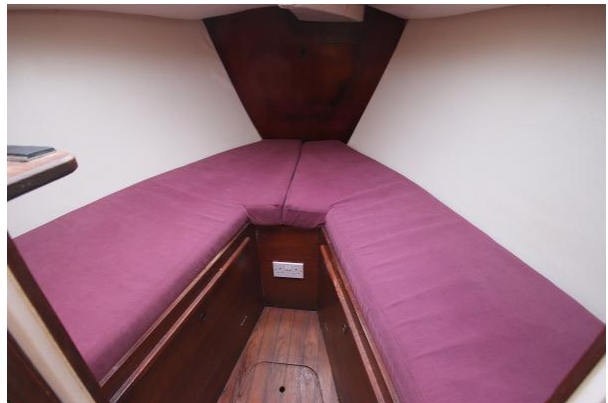
Nicholson 35 forecabin