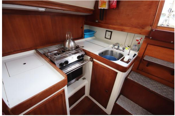
Nicholson 35 galley