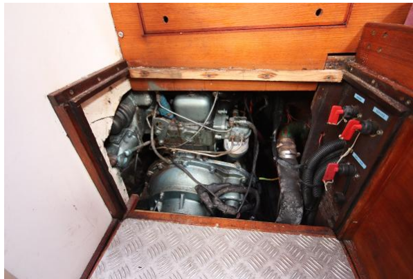
Nicholson 35 engine