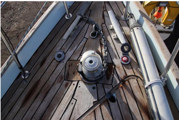
Nicholson 35 anchor windlass