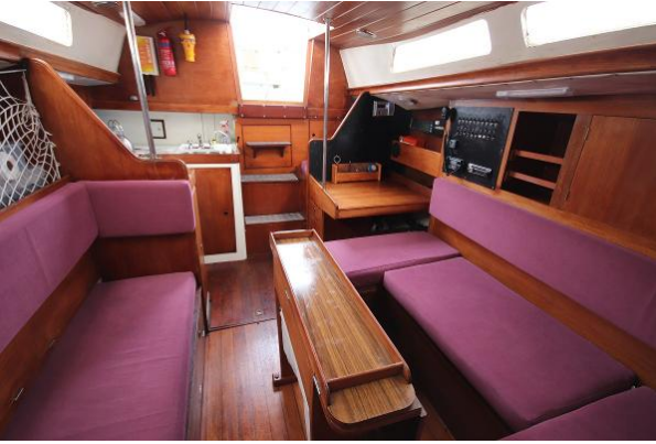
Nicholson 35 looking aft