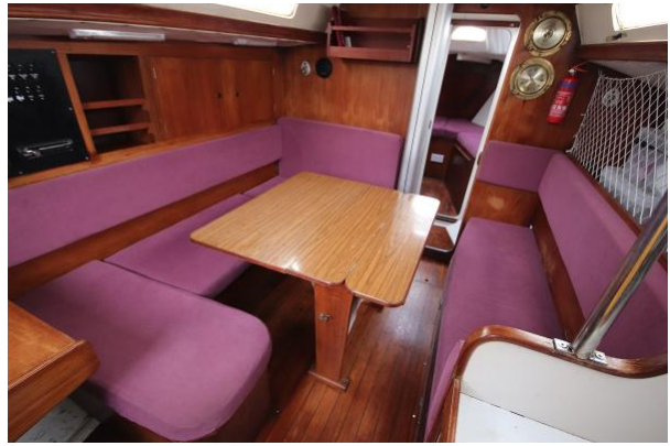
Nicholson 35 new upholstery