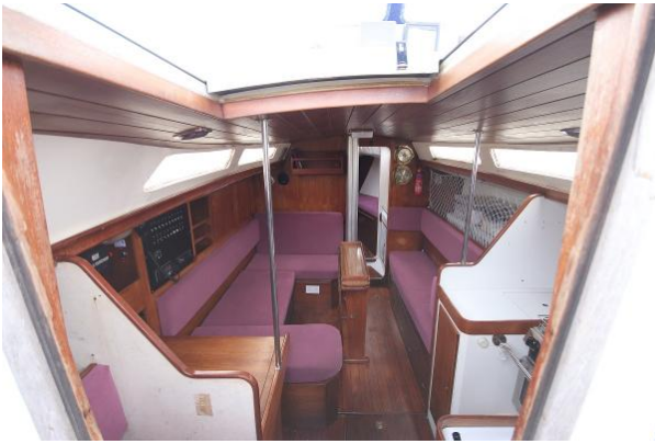
Nicholson 35 looking below