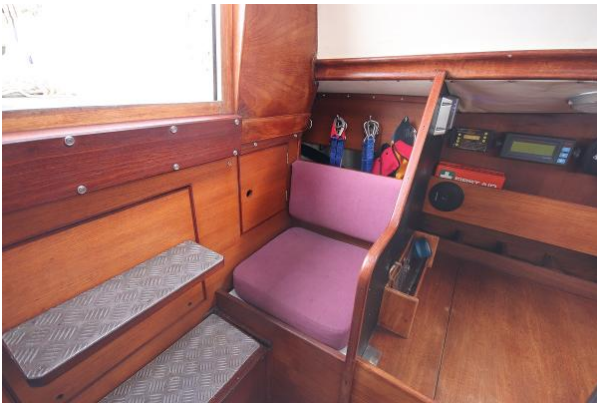
Nicholson 35 chart table and watchmans seat