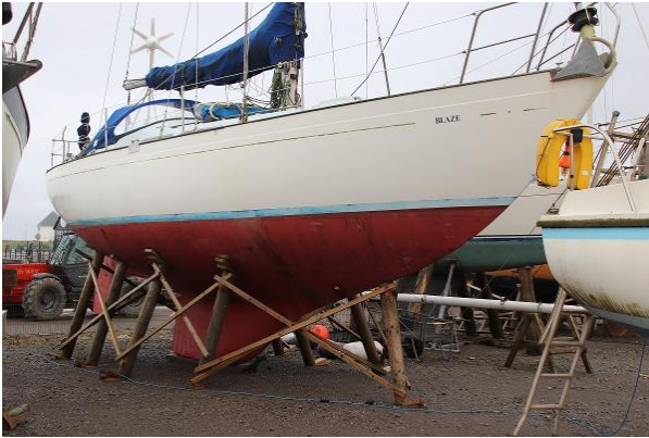
Nicholson 35 long keel