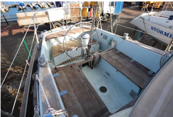
Nicholson 35 large cockpit