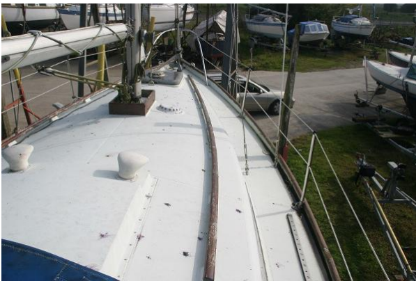
Halmatic 30 Foredeck