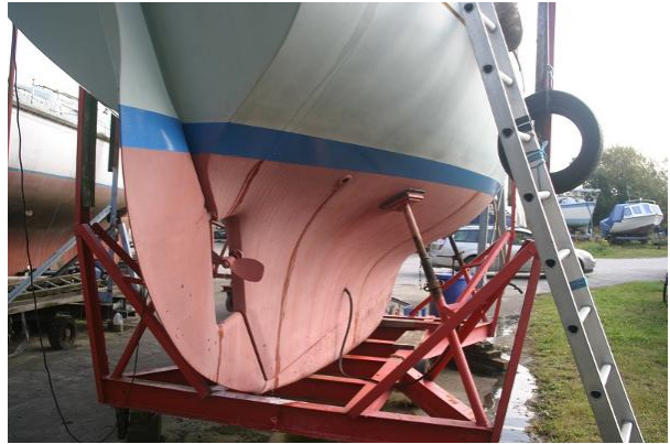
Halmatic 30 transom hung rudder