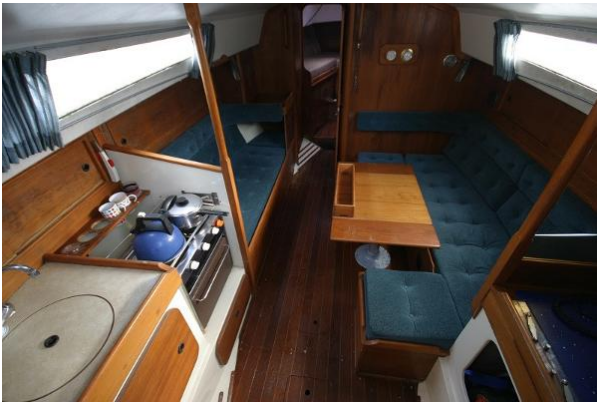
Halmatic 30 saloon