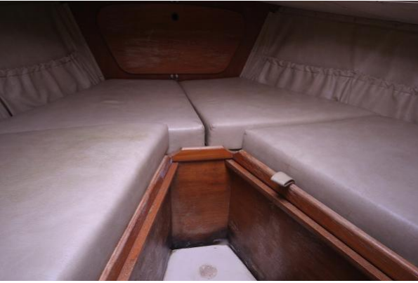
Halmatic 30 forecabin