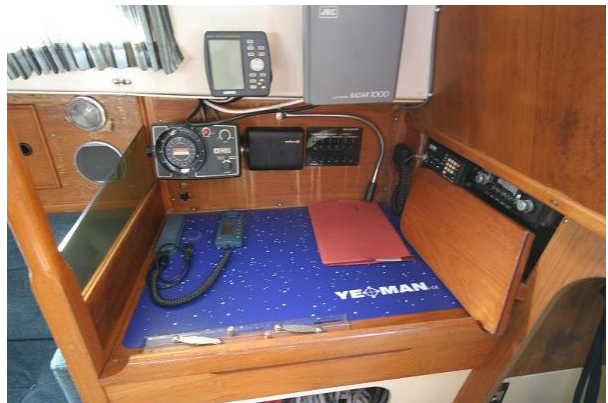
Halmatic 30 chart table