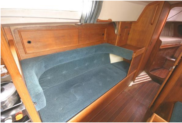
Halmatic 30 saloon seating