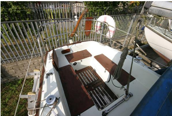
Halmatic 30 cockpit