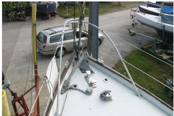
Halmatic 30 anchor winch