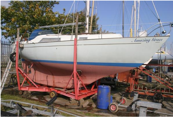
Halmatic 30 cradle included