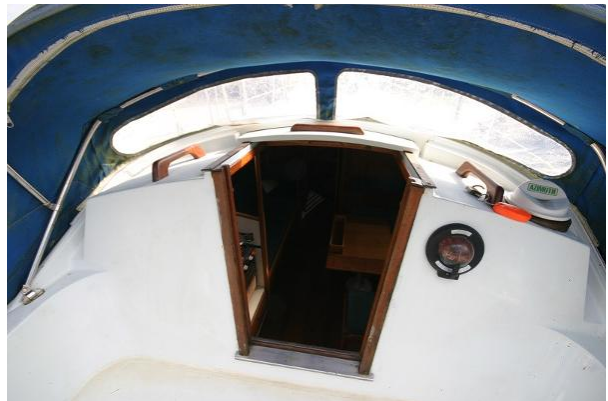
Halmatic 30 sprayhood