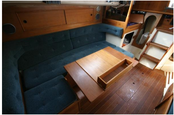
Halmatic 30 saloon table