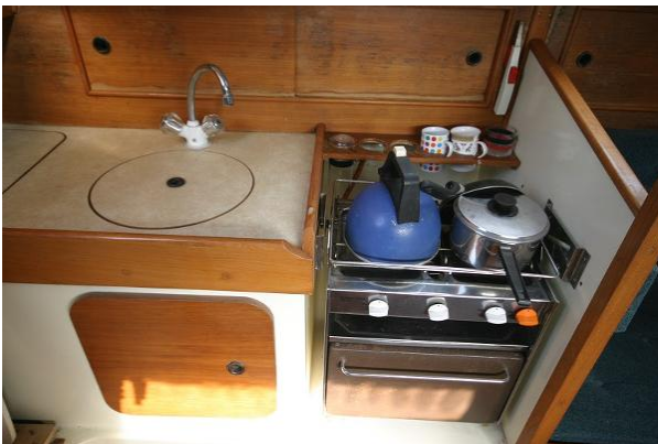
Halmatic 30 galley