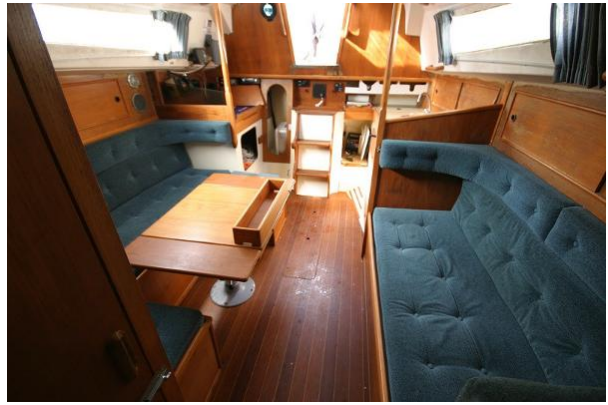
Halmatic 30 saloon looking aft