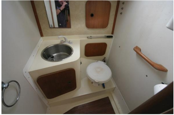
Halmatic 30 heads