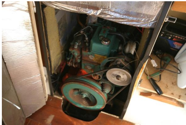
Halmatic 30 engine