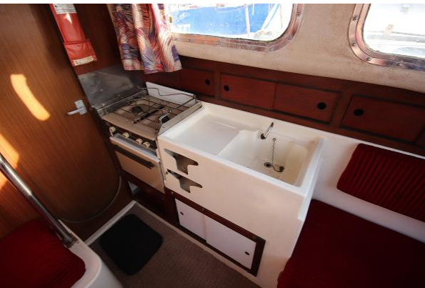
Westerly Centaur galley