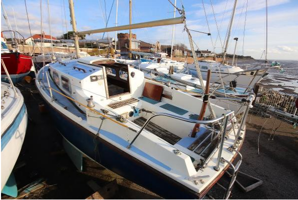
Westerly Centaur Sapphire