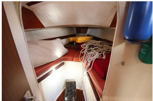
Westerly Centaur foreberth