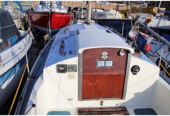
Westerly Centaur main hatch