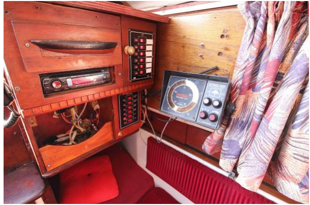
Westerly Centaur instruments