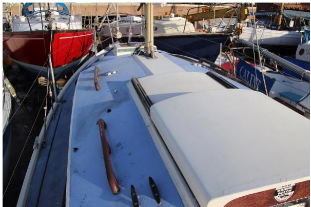
Westerly Centaur deck view