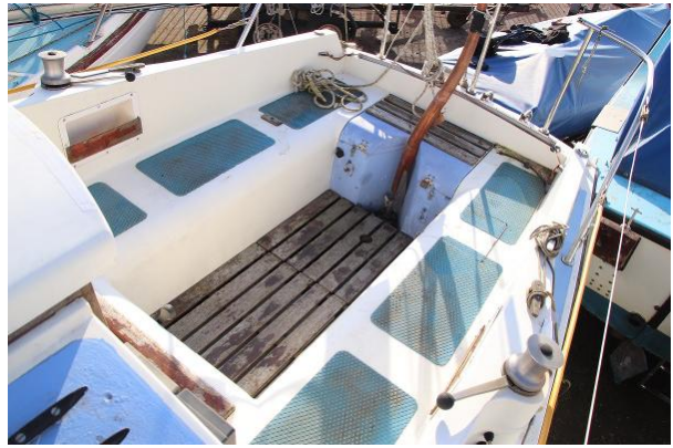
Westerly Centaur cockpit