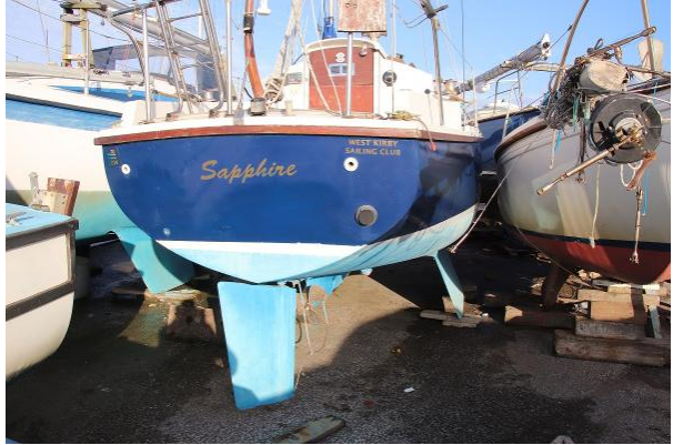
Westerly Centaur bilge keel