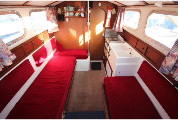
Westerly Centaur saloon