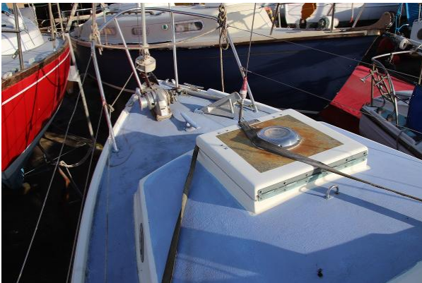
Westerly Centaur foredeck