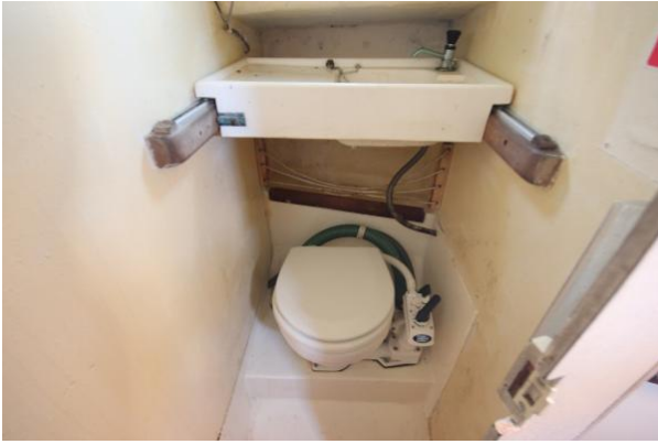
Westerly Centaur heads