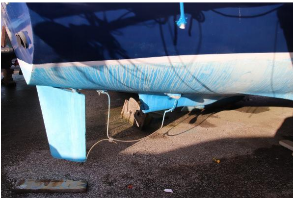
Westerly Centaur rudder