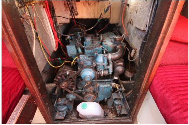
Westerly Centaur engine