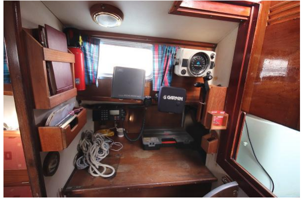
Sea Dog 30 nav station