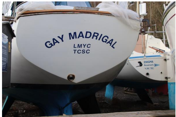
Sea Dog 30 stern view