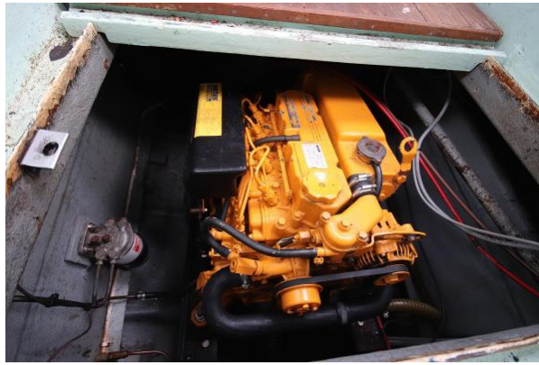
Sea Dog 30 Vetus engine