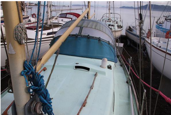
Sea Dog 30 ketch rig