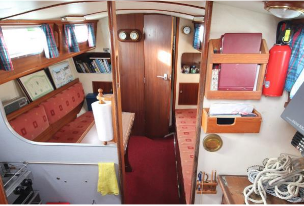
Sea Dog 30 saloon