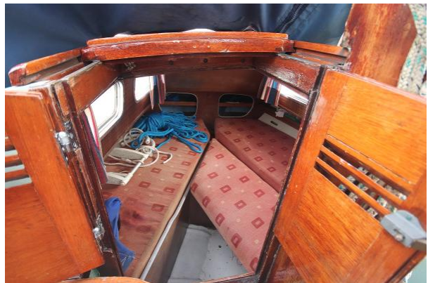
Sea Dog 30 aft cabin