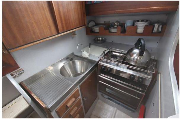
Sea Dog 30 galley