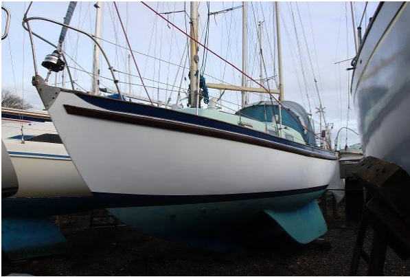
Sea Dog 30 ketch