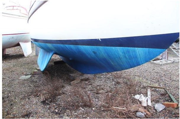
Sea Dog 30 triple keel