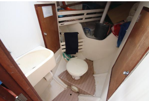
Sea Dog 30 heads in forepeak