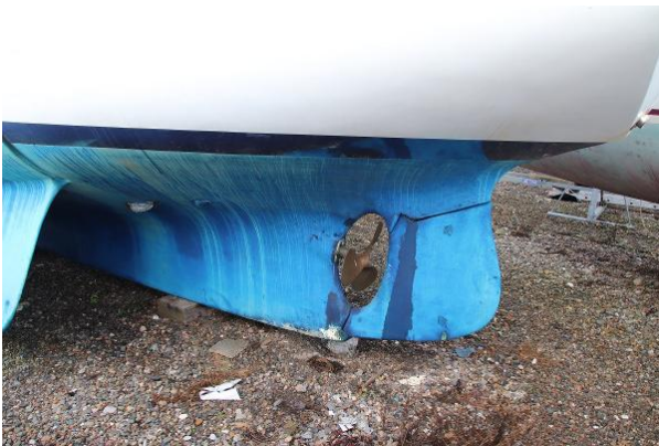
Sea Dog 30 rudder and prop