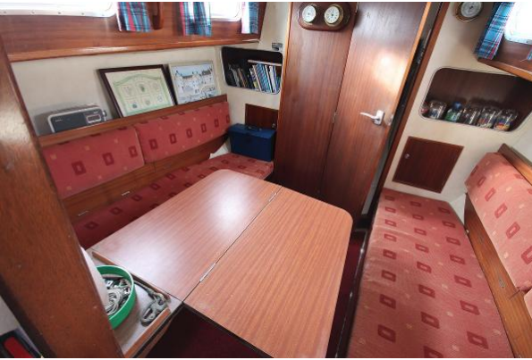
Sea Dog 30 saloon table