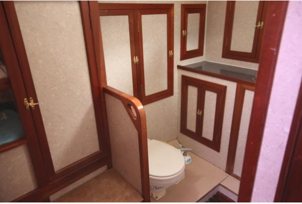
Ocean Going Sea Trader master ensuite