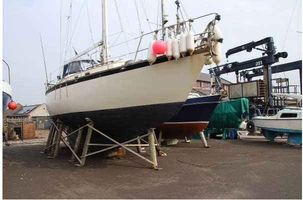
Ocean Going Sea Trader on the hard