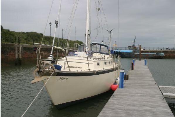
Ocean Going Sea Trader on her berth