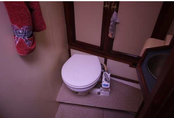
Ocean Going Sea Trader forward heads