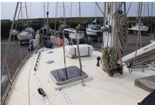
Ocean Going Sea Trader deck view