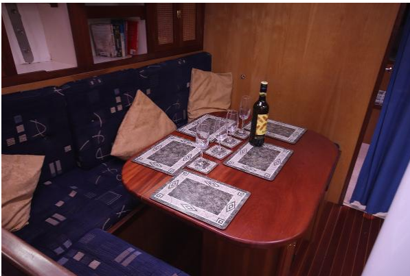
Ocean Going Sea Trader saloon table