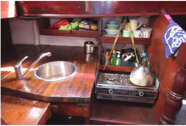
Maurice Griffiths ketch galley