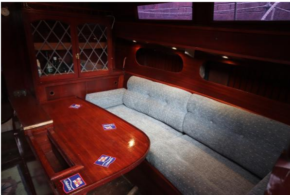
Maurice Griffiths ketch saloon starboard