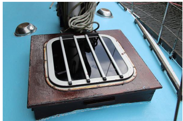
Maurice Griffiths ketch forehatch