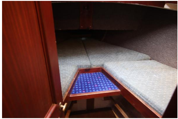
Maurice Griffiths ketch forecabin