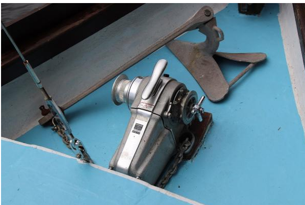
Maurice Griffiths ketch anchor winch