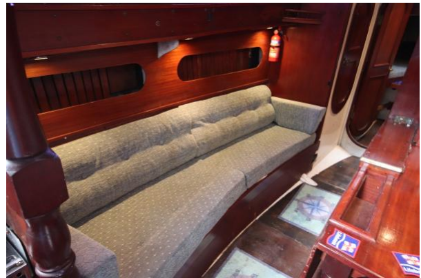
Maurice Griffiths ketch saloon port