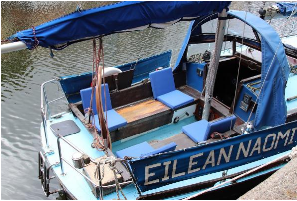
Maurice Griffiths ketch cockpit