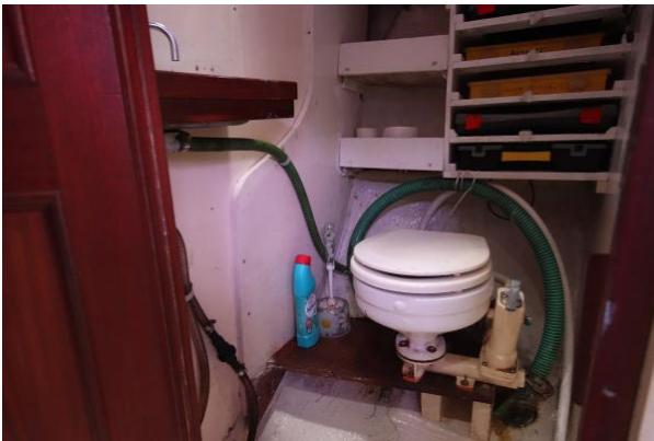
Maurice Griffiths ketch heads