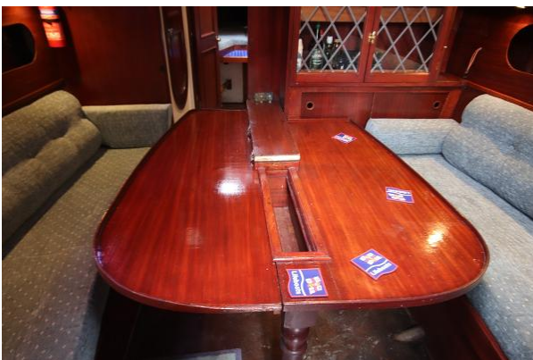
Maurice Griffiths ketch saloon table