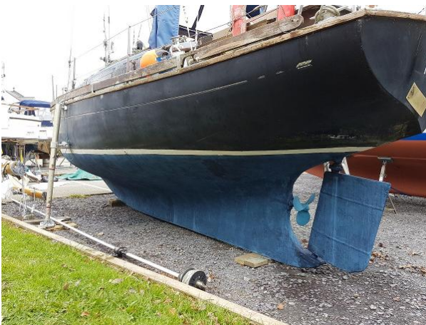
Maurice Griffiths ketch long keel