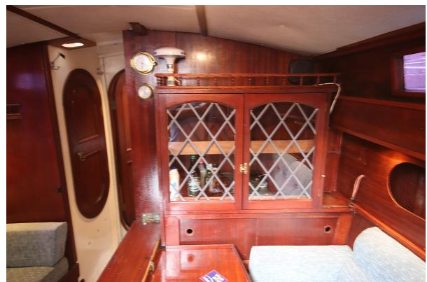
Maurice Griffiths ketch saloon storage