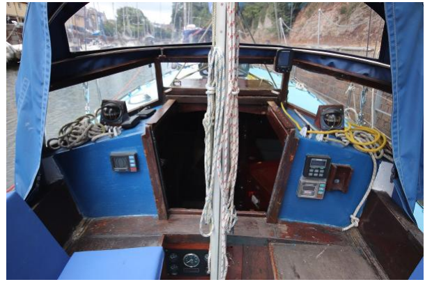
Maurice Griffiths ketch mainhatch