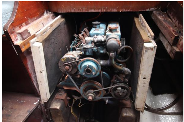
Maurice Griffiths ketch engine