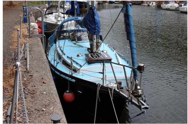
Maurice Griffiths ketch bowsprit