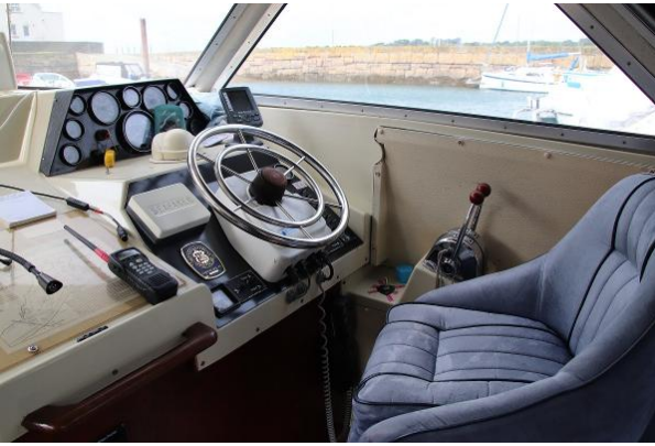
Fjord Sedan 32 helm