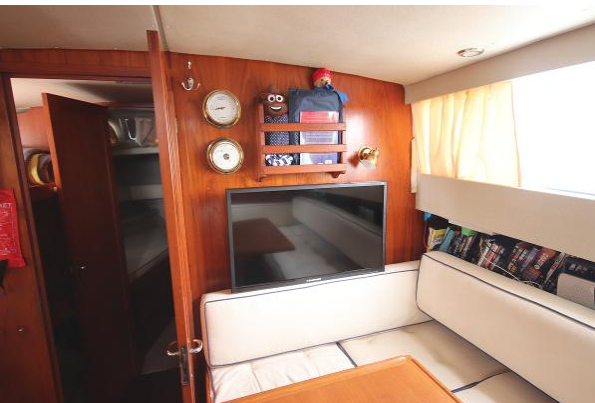
Fjord Sedan 32 TV