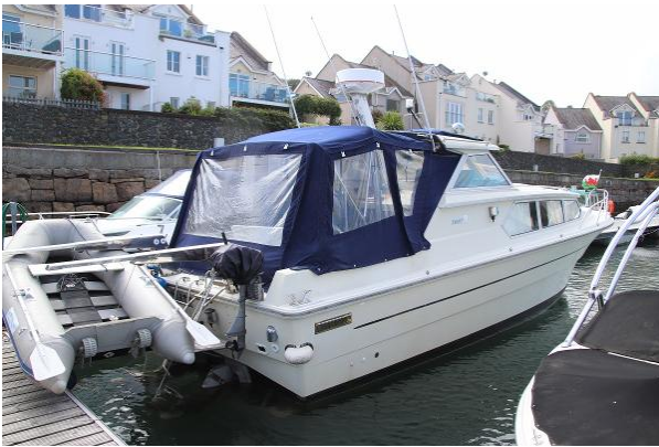
Fjord Sedan 32 stern view with davits