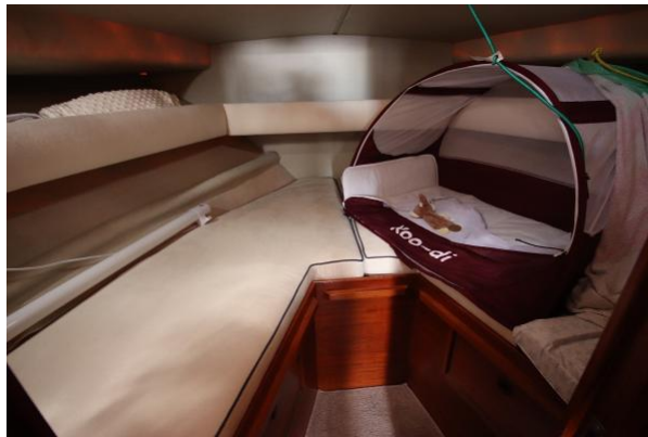
Fjord Sedan 32 forecabin