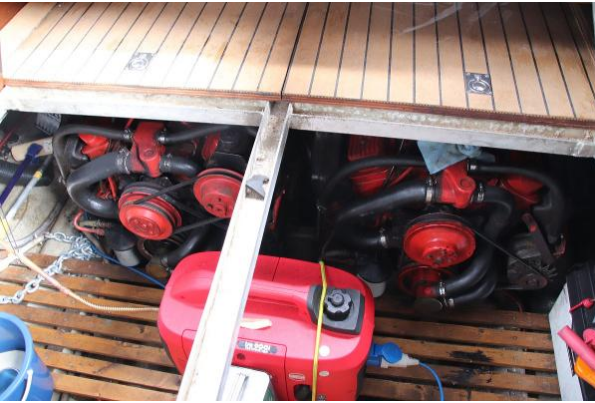
Fjord Sedan 32 twin engines