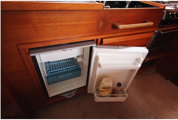
Fjord Sedan 32 fridge