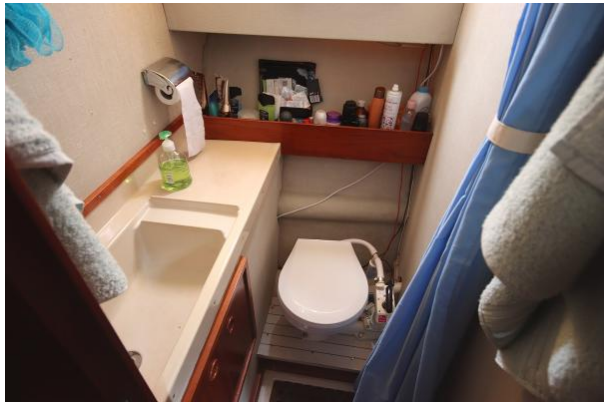
Fjord Sedan 32 heads