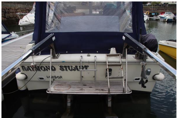
Fjord Sedan 32 stern view bathing platform