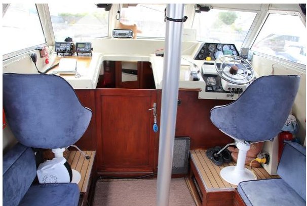
Fjord Sedan 32 helm position