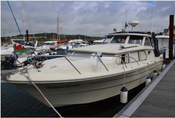
Fjord Sedan 32 on her berth