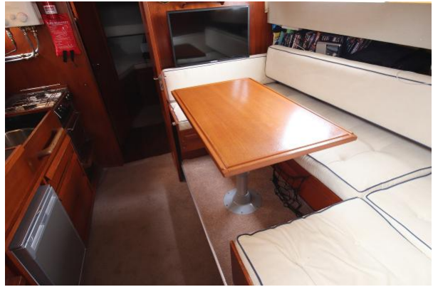
Fjord Sedan 32 saloon