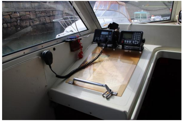
Fjord Sedan 32 instruments