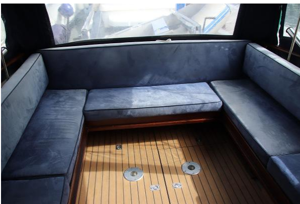
Fjord Sedan 32 cockpit seating