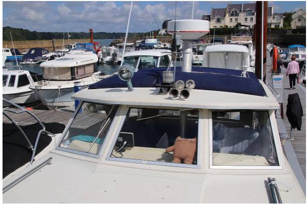
Fjord Sedan 32 wheelhouse