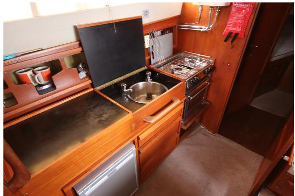
Fjord Sedan 32 galley