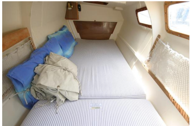
Wharram Tiki 30 starboard hull