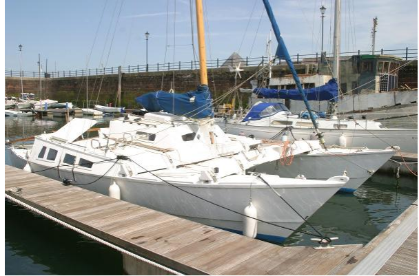
Wharram Tiki 30 on her berth