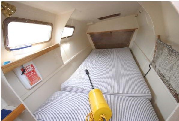
Wharram Tiki 30 port hull