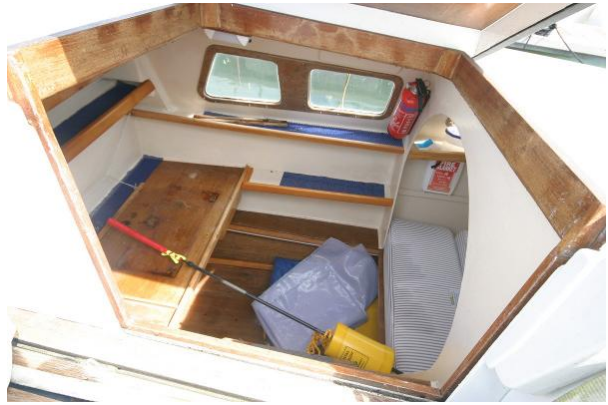
Wharram Tiki 30 port hatch