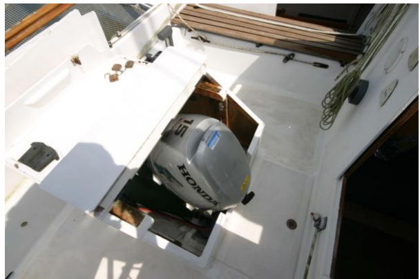
Wharram Tiki 30 engine well