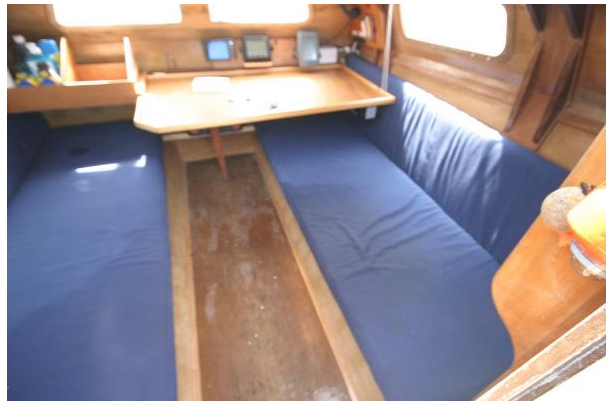
Wharram Tiki 30 central pod