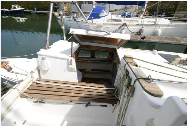
Wharram Tiki 30 port hatch