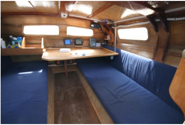
Wharram Tiki 30