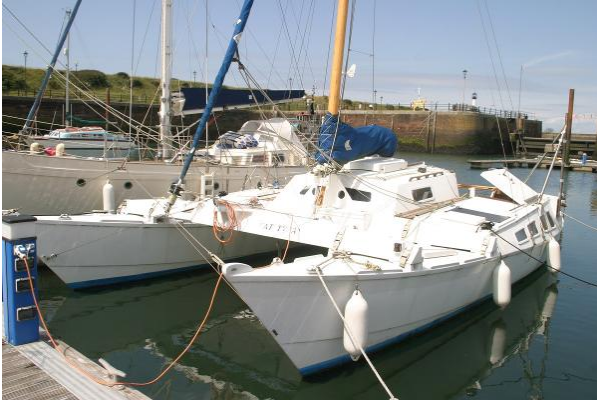
Wharram Tiki 30