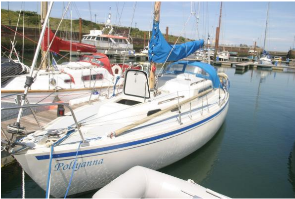
Albin Vega 27 port side view