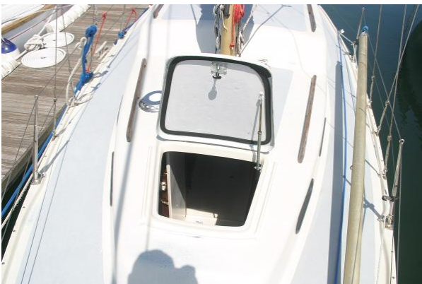
Albin Vega 27 deck view