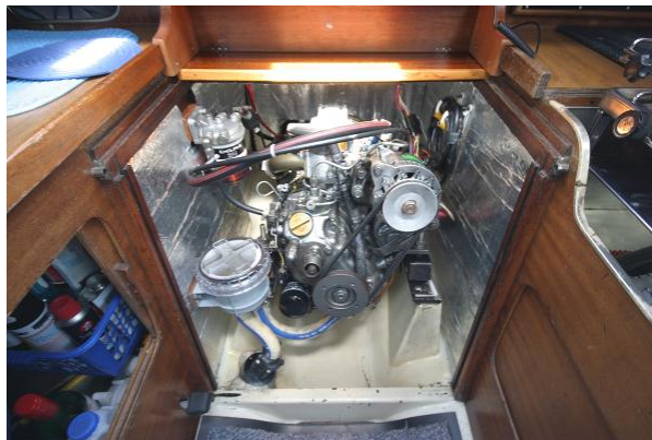
Albin Vega 27 engine