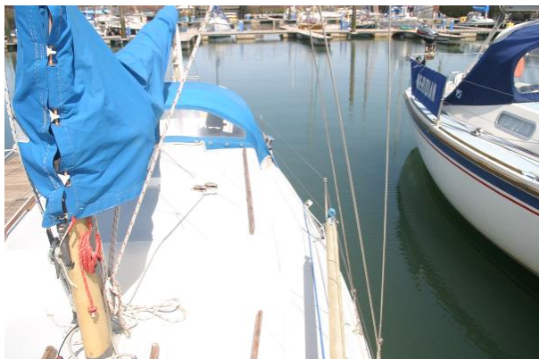
Albin Vega 27 looking aft