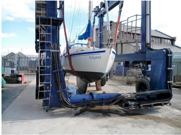
Albin Vega 27 in the hoist