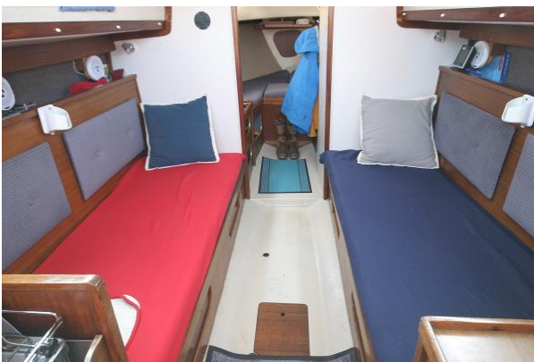
Albin Vega 27 two berths in saloon