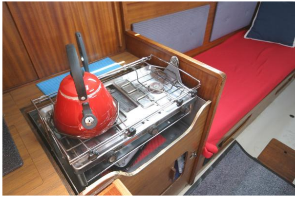
Albin Vega 27 stove