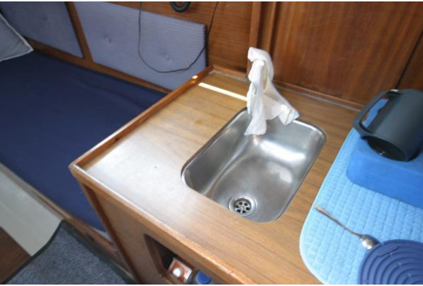
Albin Vega 27 sink