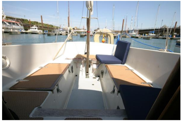
Albin Vega 27 view from main hatch