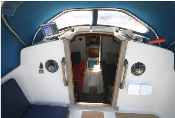
Albin Vega 27 main hatch