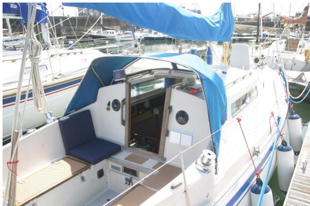
Albin Vega 27 cockpit