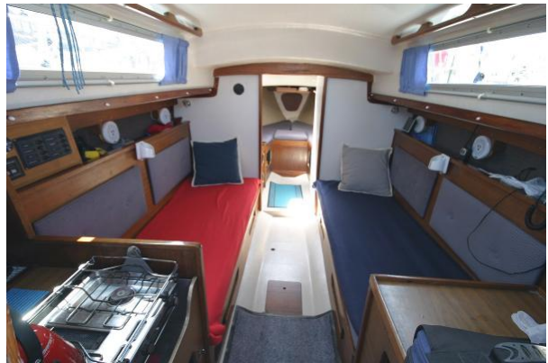
Albin Vega 27 below