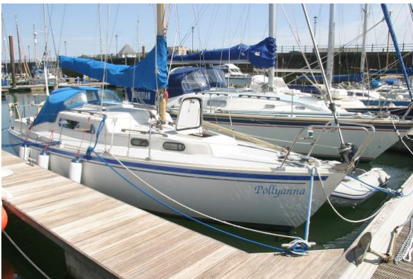
Albin Vega 27 on her berth