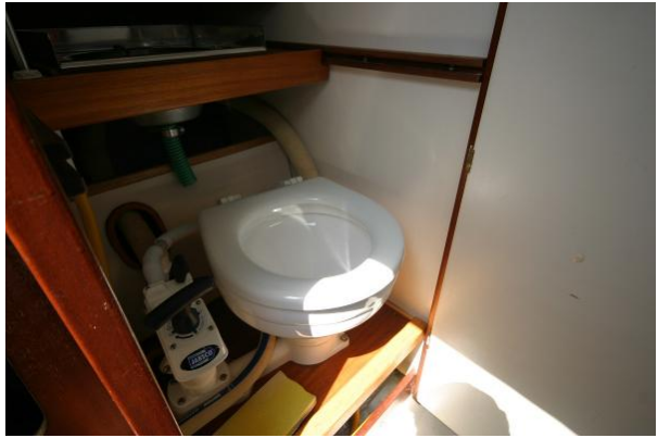
Albin Vega 27 heads