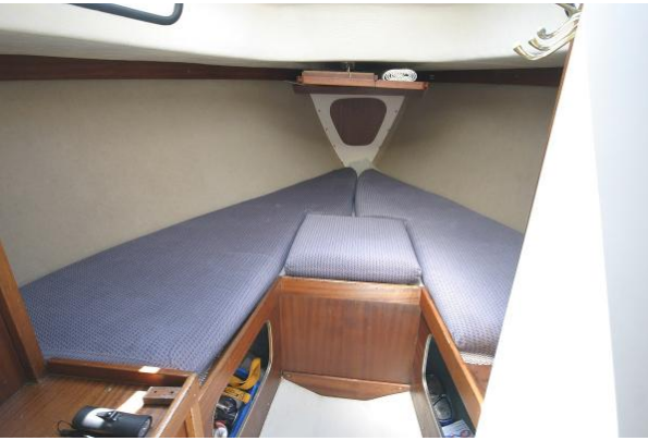
Albin Vega 27 foreberth