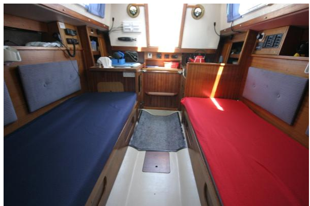
Albin Vega 27 saloon looking aft