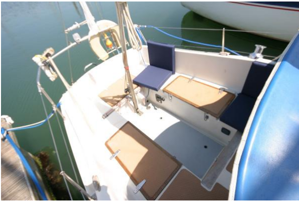
Albin Vega 27 cockpit