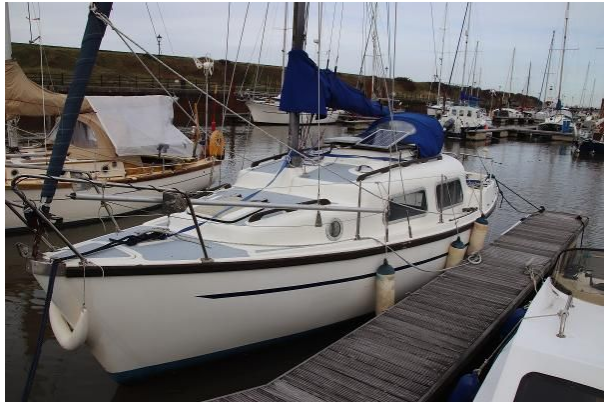
Leisure 23 on her berth