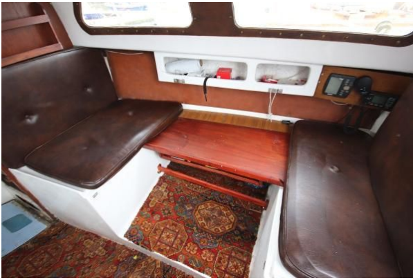
Leisure 23 saloon detail