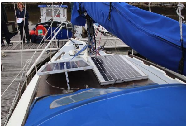
Leisure 23 deck view