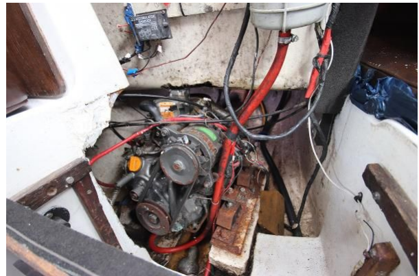
Leisure 23 Yanmar engine