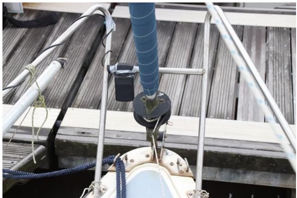
Leisure 23 furling genoa