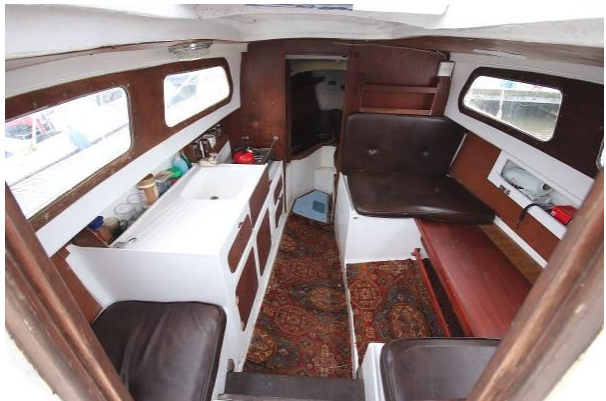
Leisure 23 saloon