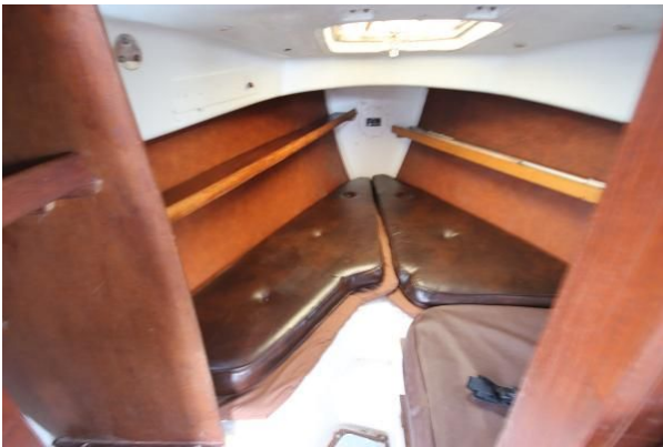
Leisure 23 forecabin