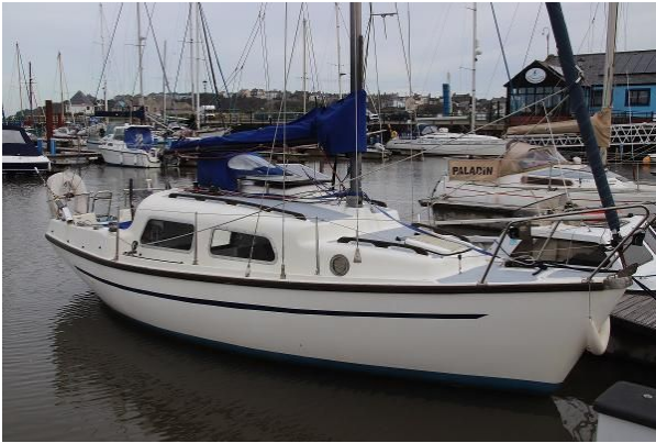
Leisure 23 Maryport Marina