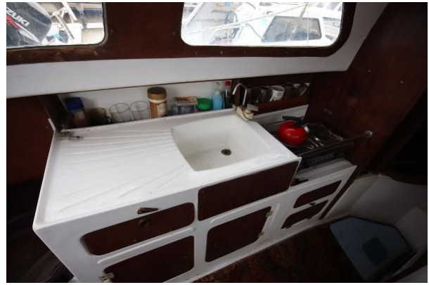
Leisure 23 galley