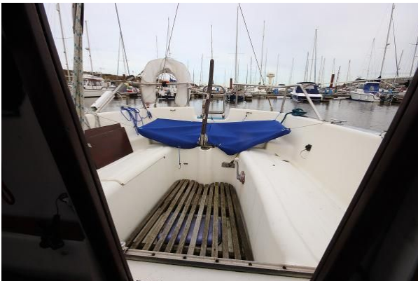
Leisure 23 cockpit