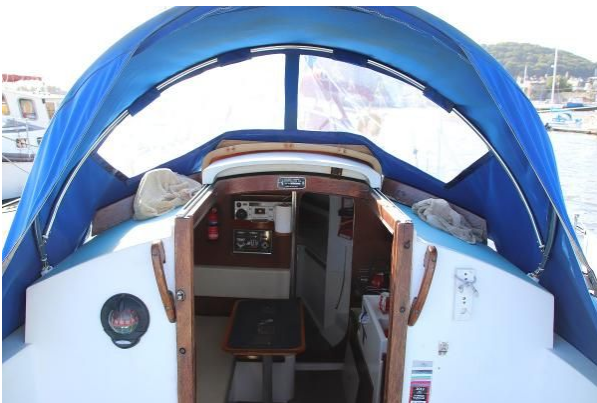
Westerly Centaur sprayhood