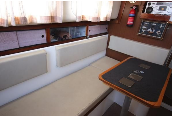
Westerly Centaur saloon