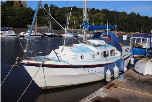
Westerly Centaur on her berth