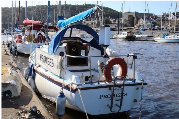
Westerly Centaur stern view