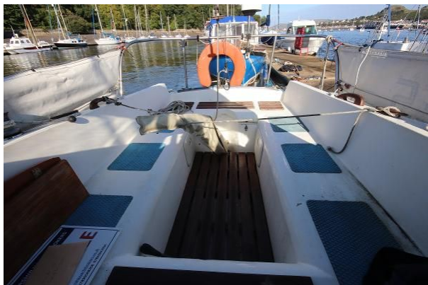
Westerly Centaur cockpit