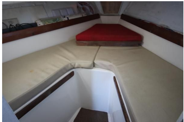
Westerly Centaur foreberth