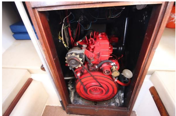
Westerly Centaur Buhk engine