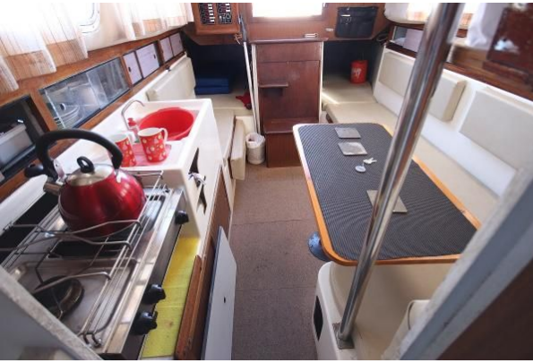
Westerly Centaur saloon