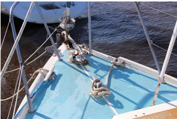
Westerly Centaur foredeck