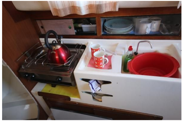
Westerly Centaur galley