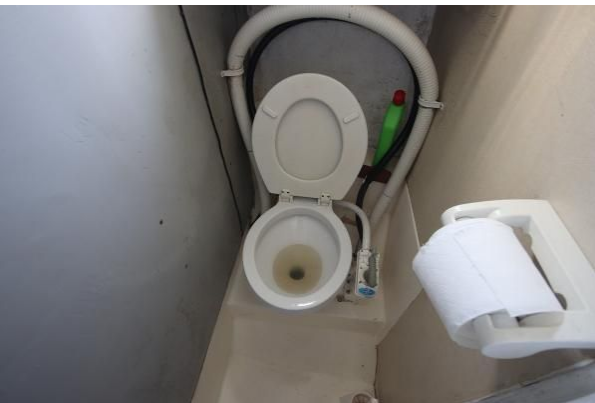
Westerly Centaur heads