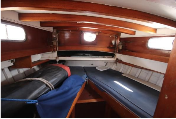
Hillyard 16 Tonner forecabin