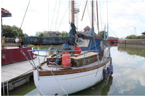
Hillyard 16 Tonner on her berth