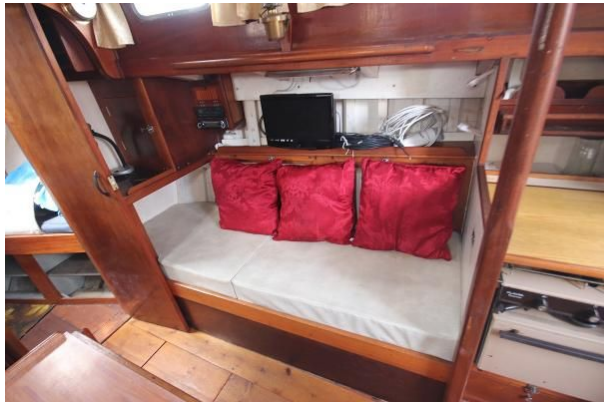
Hillyard 16 Tonner saloon seating