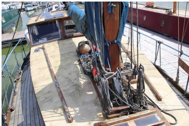
Hillyard 16 Tonner deck view