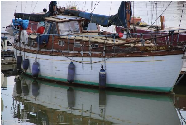
Hillyard 16 Tonner Moonflower