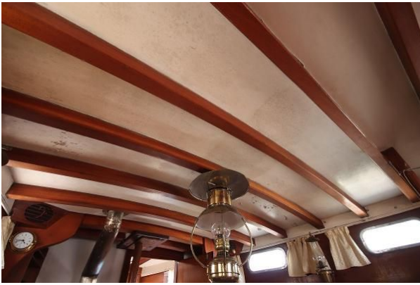
Hillyard 16 Tonner saloon deckhead