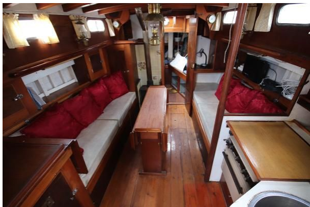
Hillyard 16 Tonner saloon