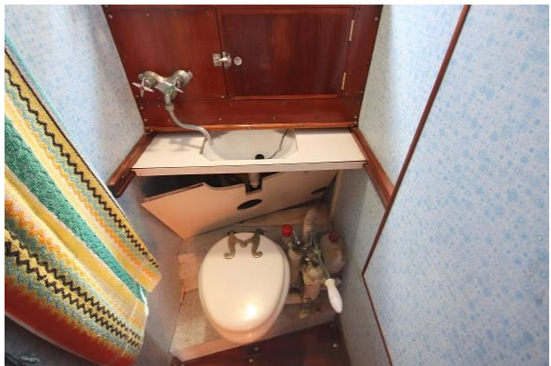
Hillyard 16 Tonner one of two heads