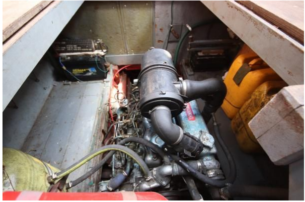
Hillyard 16 Tonner Thorneycroft engine