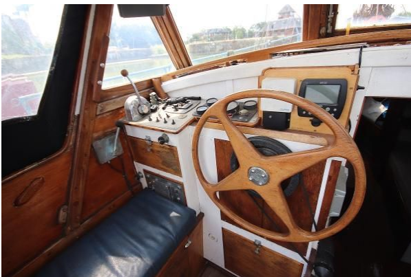
Hillyard 16 Tonner helm position