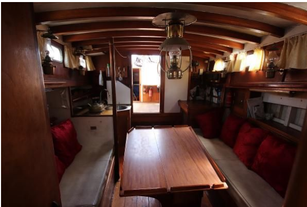
Hillyard 16 Tonner saloon table