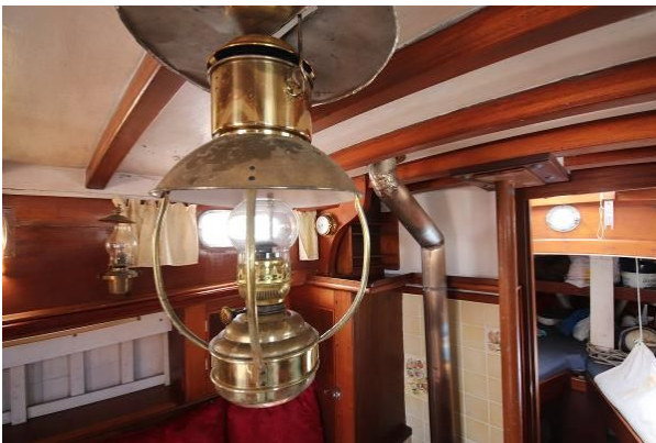
Hillyard 16 Tonner oil lamp