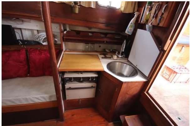
Hillyard 16 Tonner galley