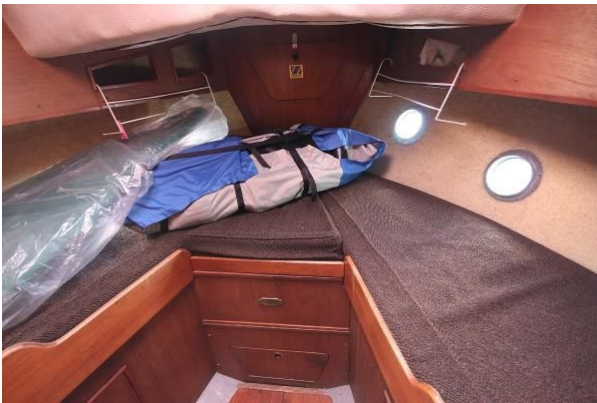
Motorsailer Island Plastics