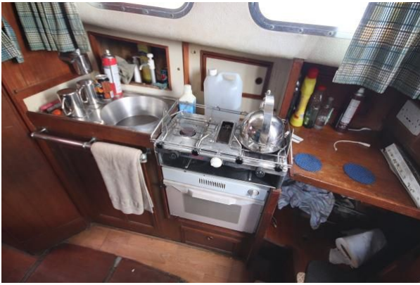
Motorsailer Island Plastics