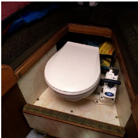
Motorsailer Island Plastics