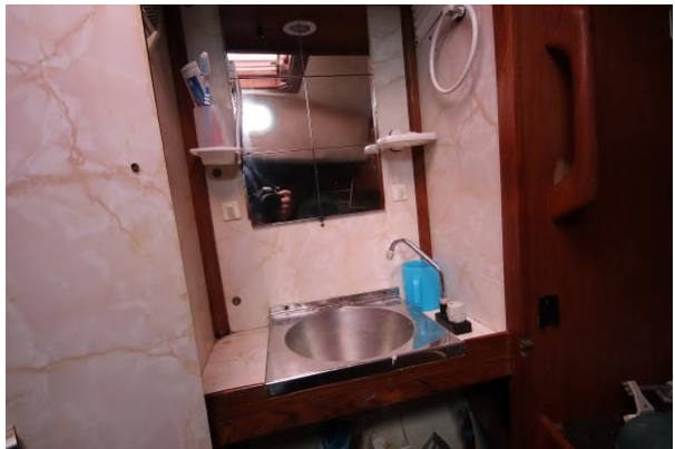
Motorsailer Island Plastics