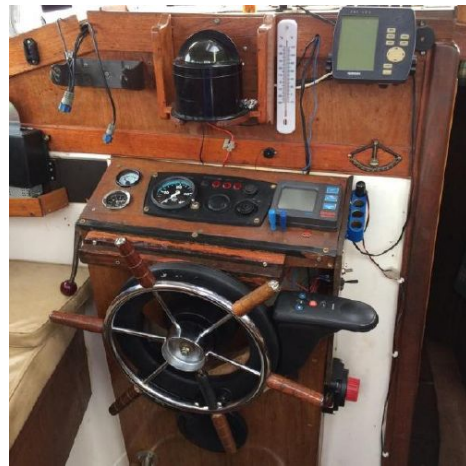
Motorsailer Island Plastics