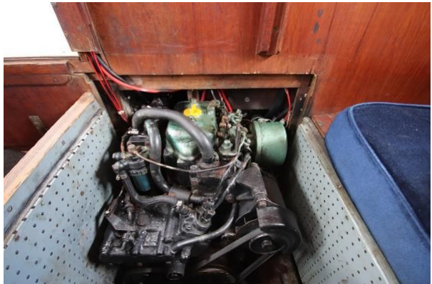
Motorsailer Island Plastics