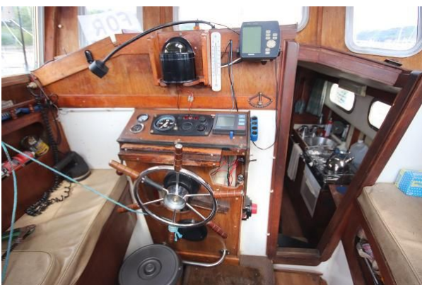
Motorsailer Island Plastics