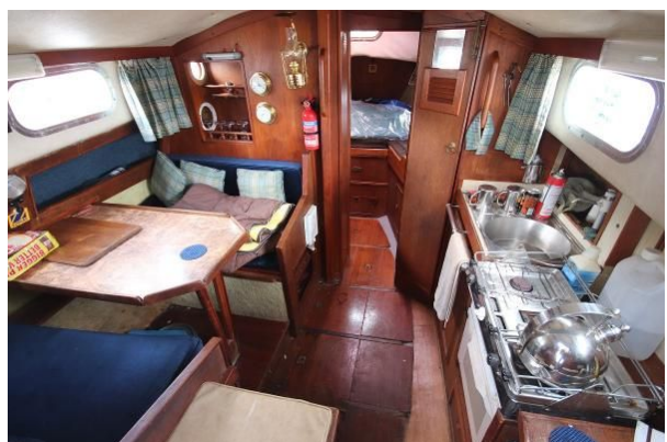
Motorsailer Island Plastics