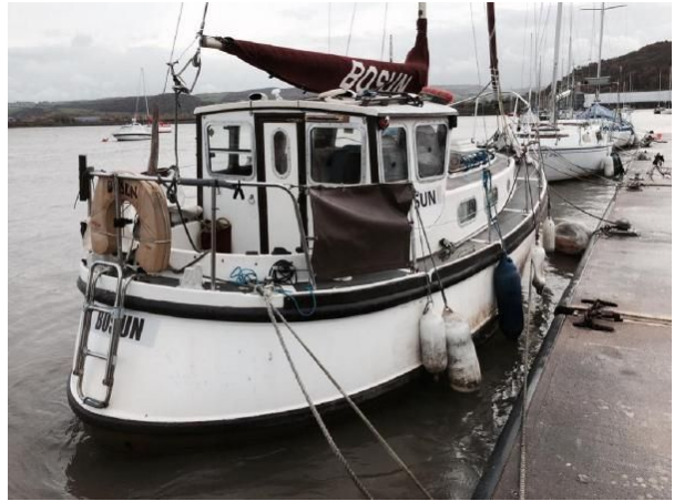
Motorsailer Island Plastics