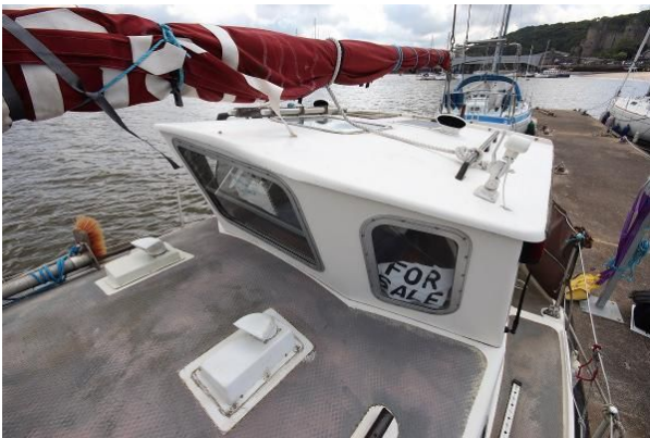
Motorsailer Island Plastics