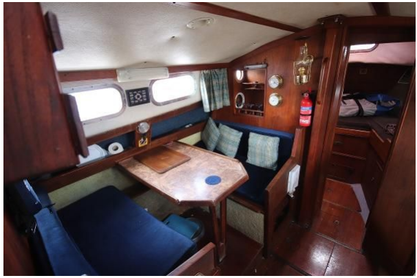
Motorsailer Island Plastics