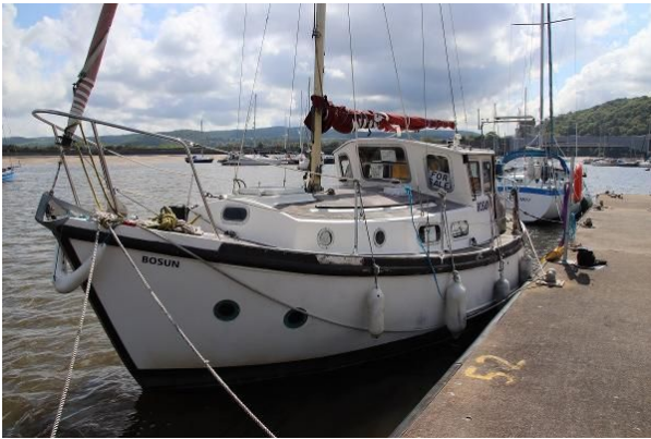
Motorsailer Island Plastics