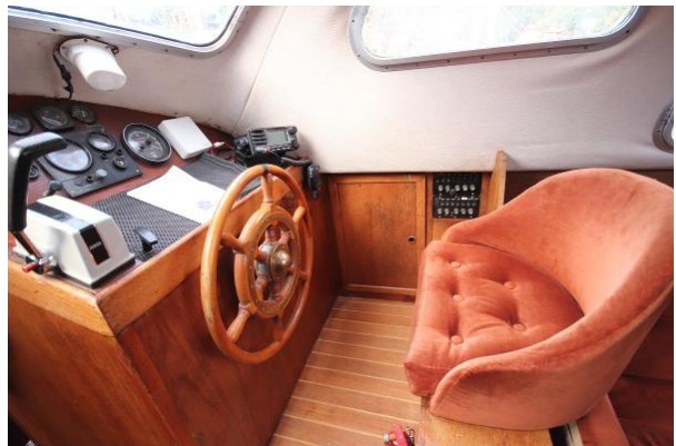
Westerly Vulcan interior helm position