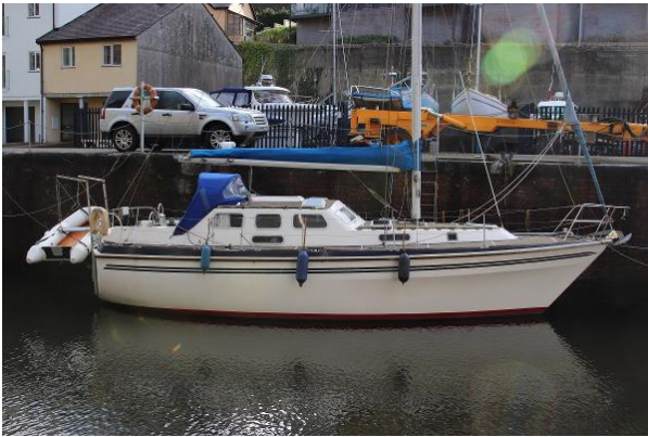
Westerly Vulcan Drakon