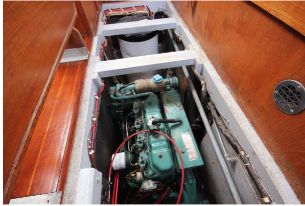
Westerly Vulcan engine accessed from saloon floor