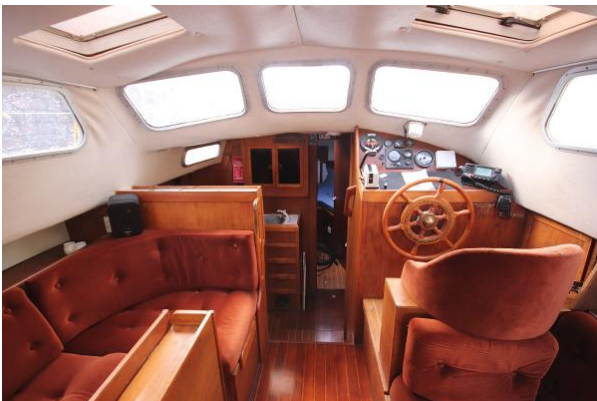
Westerly Vulcan saloon