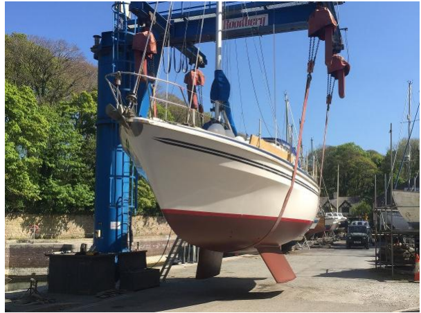
Westerly Vulcan bilge keel