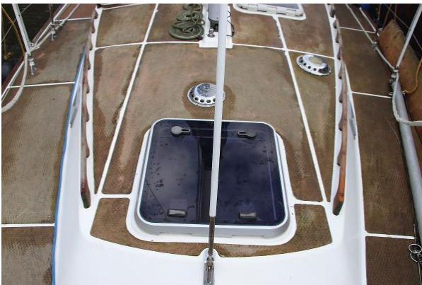
Westerly Vulcan deck view