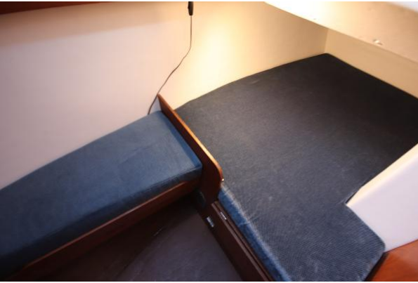
Westerly Vulcan midcabin