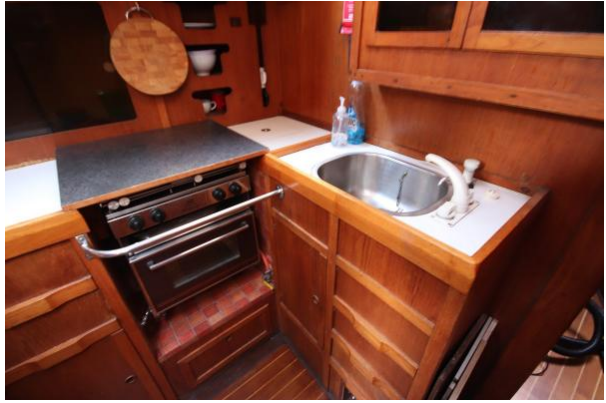
Westerly Vulcan galley