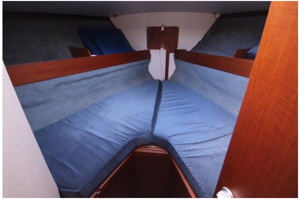
Westerly Vulcan forecabin