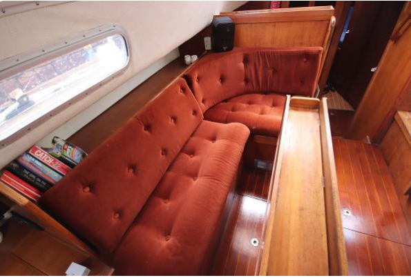
Westerly Vulcan seating