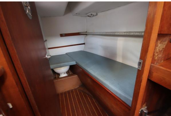
Westerly Vulcan aft cabin with heads