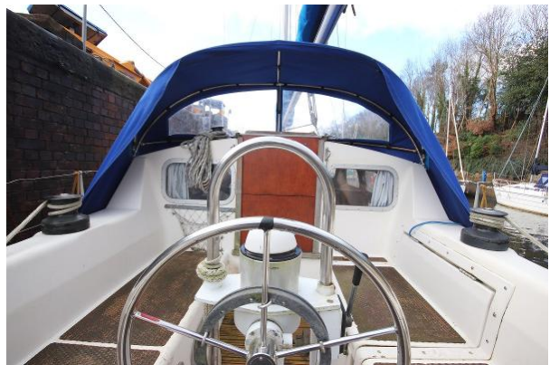
Westerly Vulcan cockpit and outer helm position