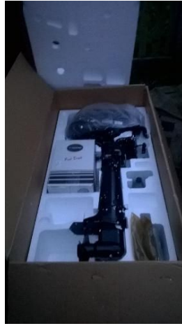
Achilles 24 4 stroke engine