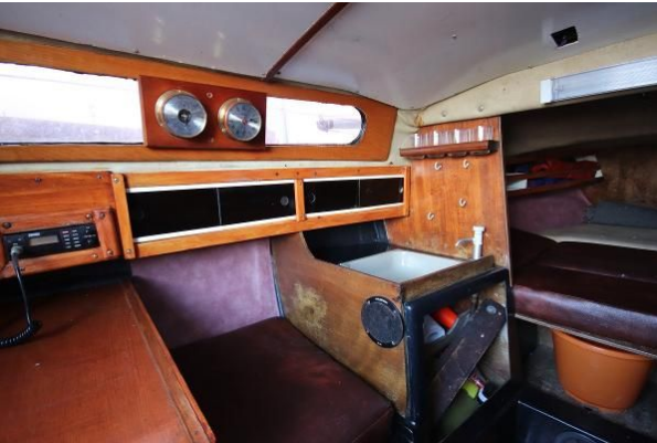
Achilles 24 port side