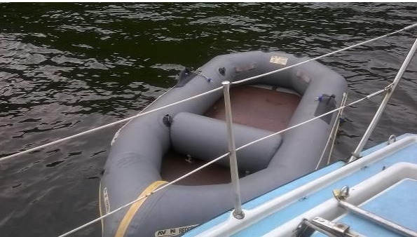
Achilles 24 Avon tender