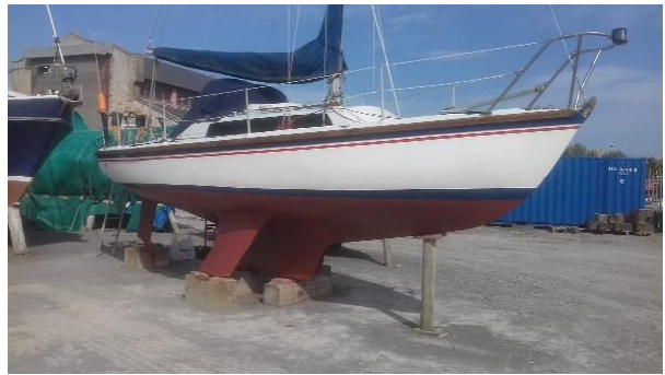
Achilles 24 triple keel