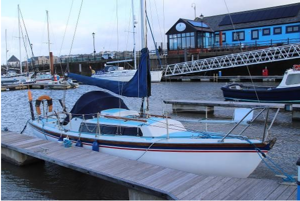
Achilles 24 on her berth