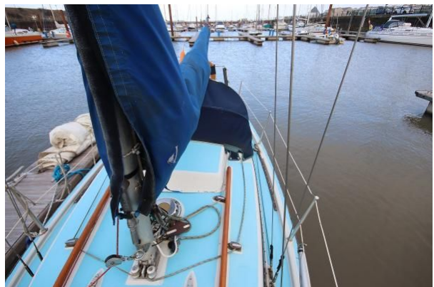
Achilles 24 deck view