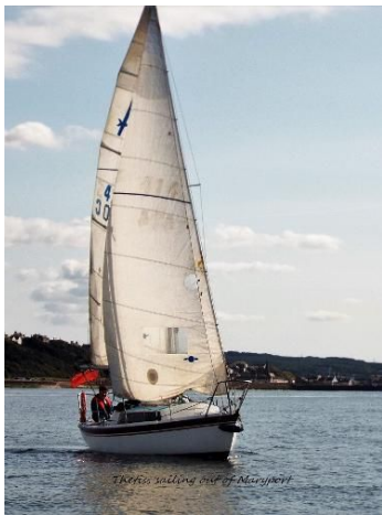
Achilles 24 under sail