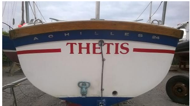
Achilles 24 Thetis