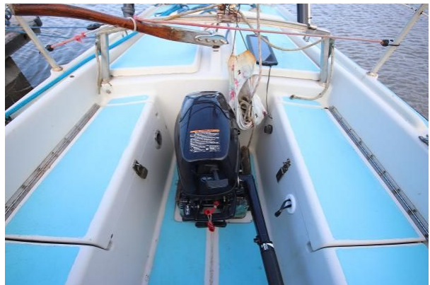
Achilles 24 engine in place