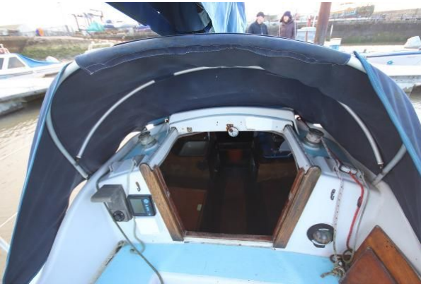
Achilles 24 sprayhood