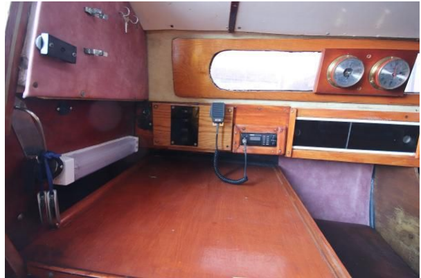
Achilles 24 chart table