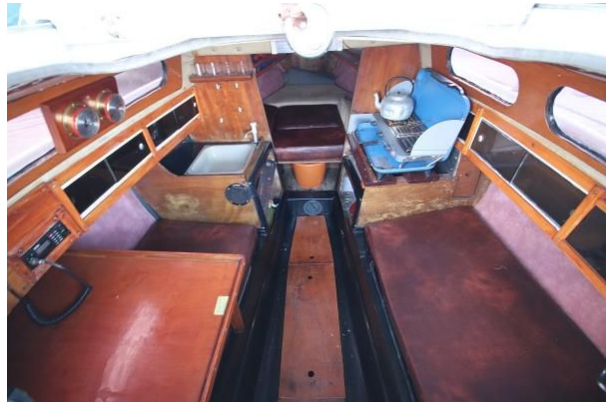
Achilles 24 below