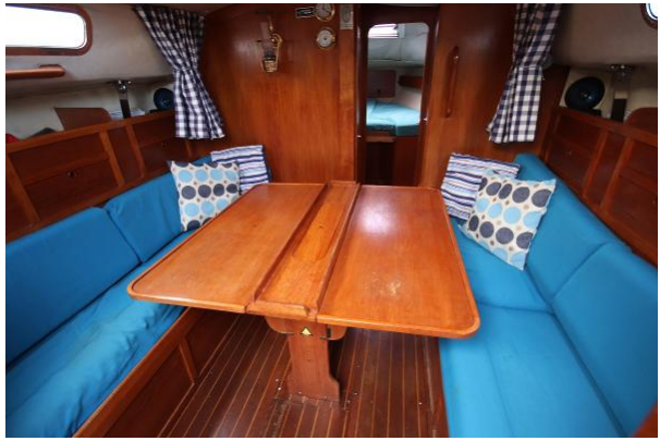
Westerly Fulmar saloon table