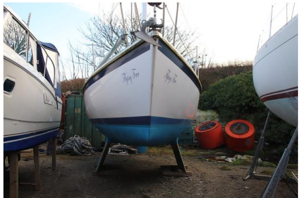
Westerly Fulmar bows view