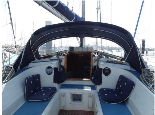
Westerly Fulmar with sprayhood