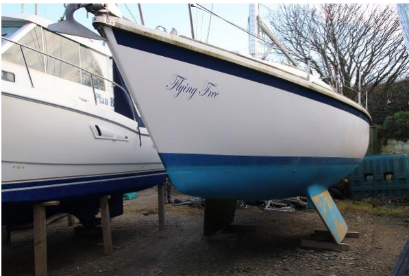
Westerly Fulmar bilge keel