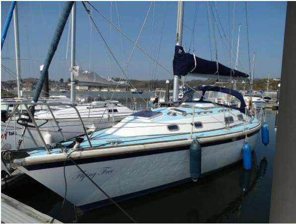
Westerly Fulmar Flying Free