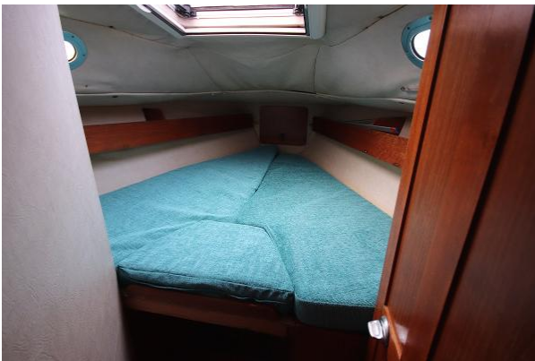
Westerly Fulmar forecabin