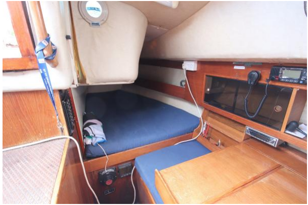
Westerly Fulmar quarter berth