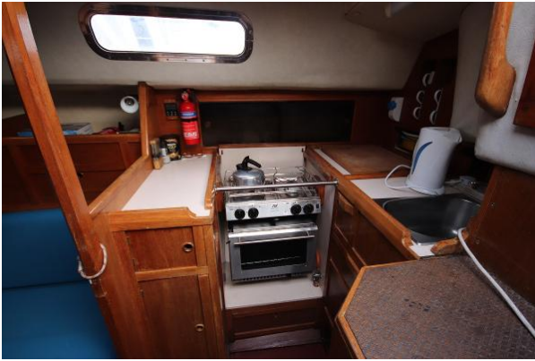
Westerly Fulmar galley