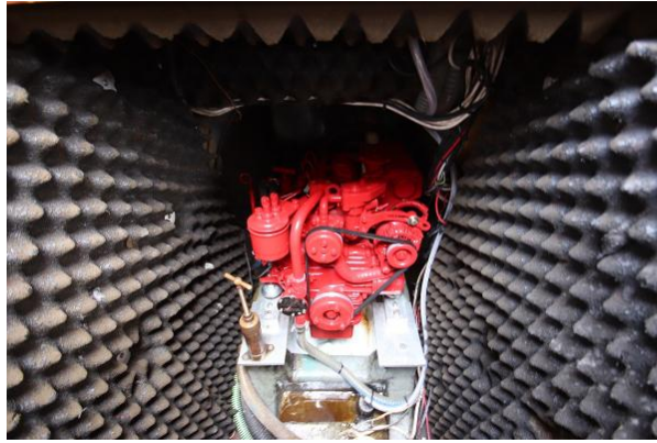
Westerly Fulmar Beta engine (2016)