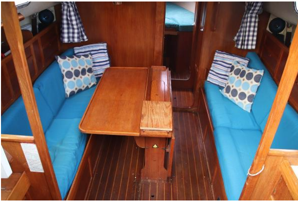
Westerly Fulmar saloon