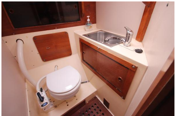
Westerly Fulmar heads