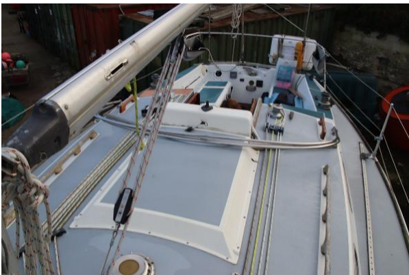
Westerly Fulmar deck view