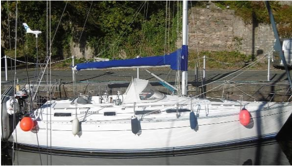
Moody 35 Serena