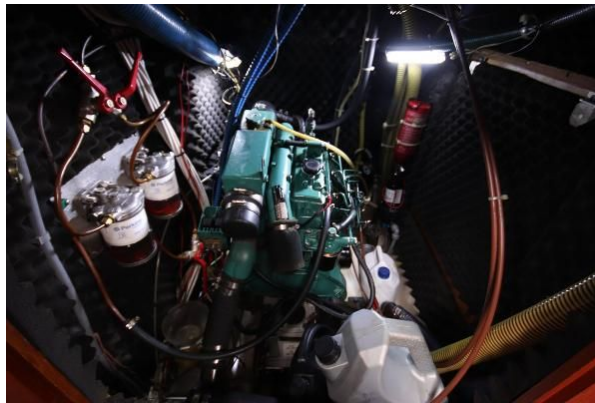
Moody 35 engine