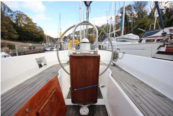
Moody 35 helm