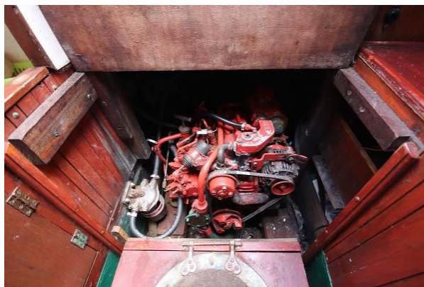
Hillyard 4 ton engine