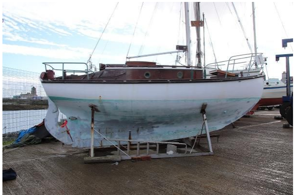
Hillyard 4 ton long keel