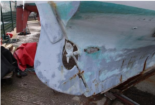
Hillyard 4 ton