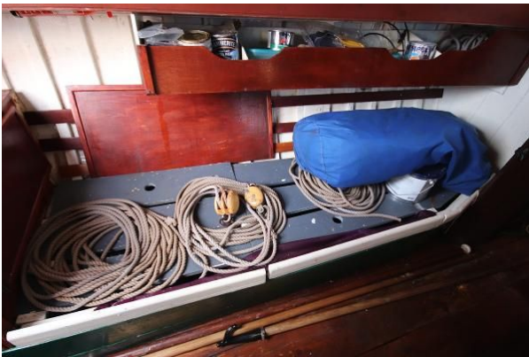
Hillyard 4 ton port berth