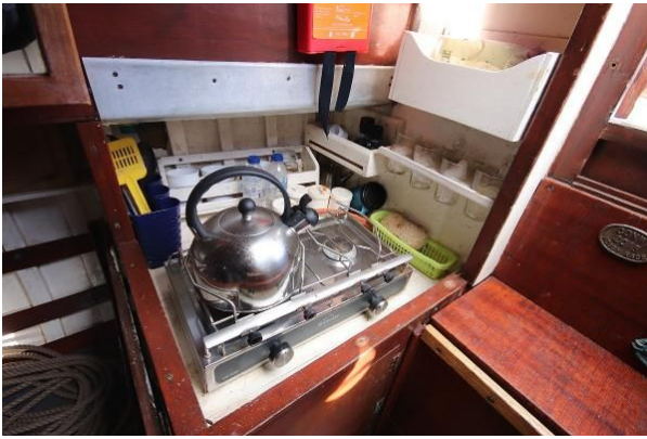
Hillyard 4 ton galley