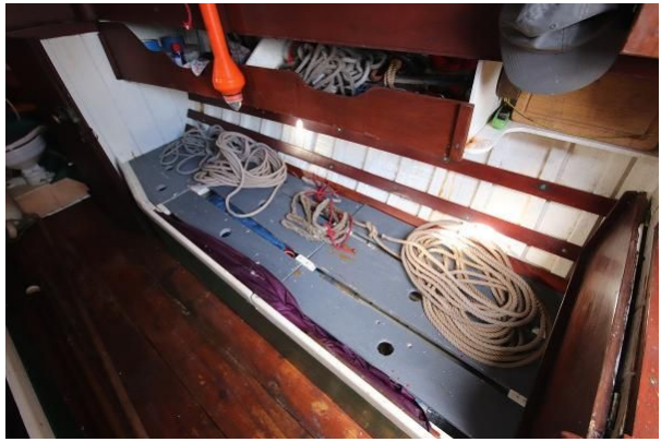
Hillyard 4 ton starboard berth