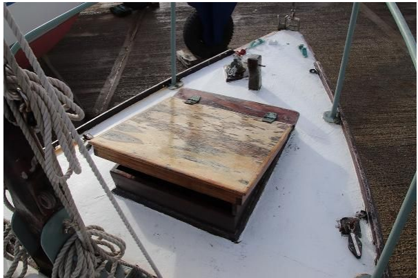
Hillyard 4 ton foredeck