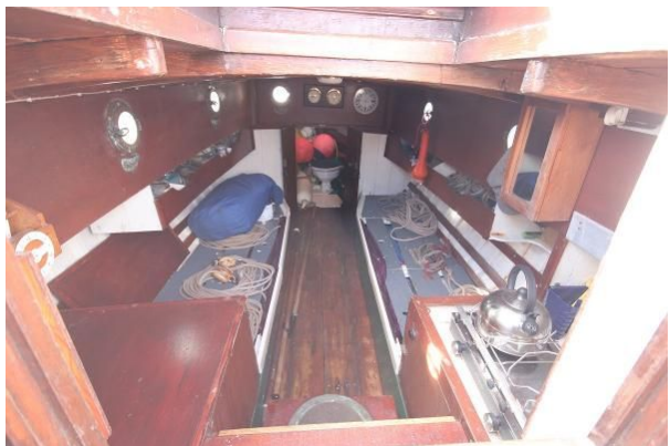
Hillyard 4 ton below