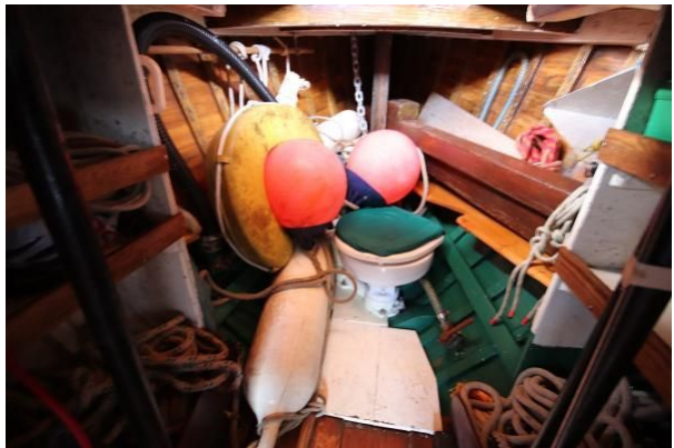
Hillyard 4 ton forepeak with heads