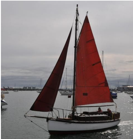
Hillyard 4 ton Minelvia