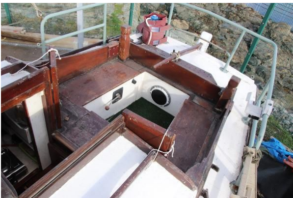
Hillyard 4 ton cockpit