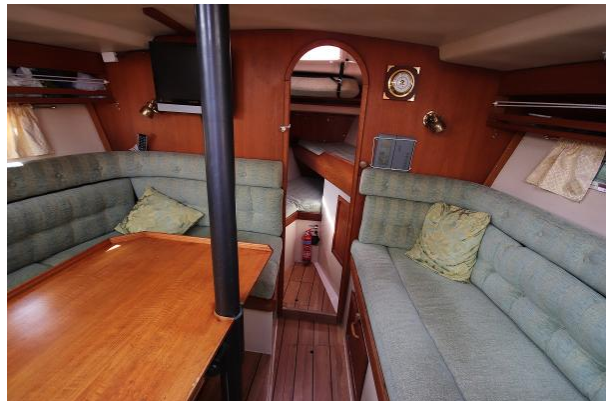
Southerly 105 saloon