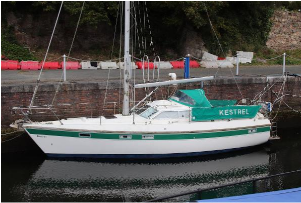
Southerly 105 on her berth