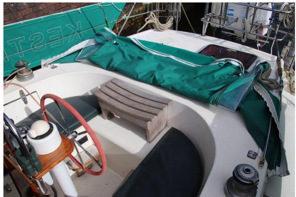
Southerly 105 helm position