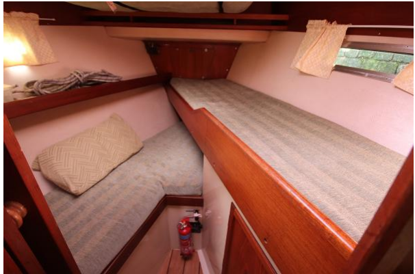
Southerly 105 forecabin