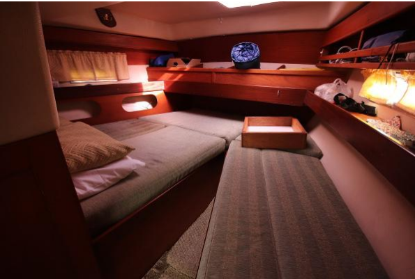
Southerly 105 aft cabin