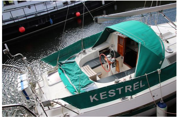
Southerly 105 cockpit view