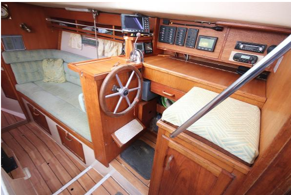
Southerly 105 inner helm position