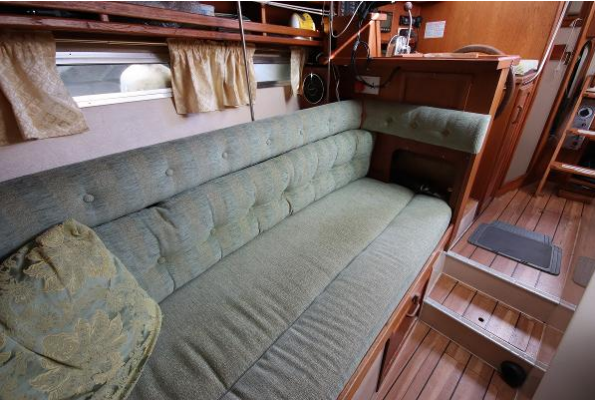
Southerly 105 saloon seating