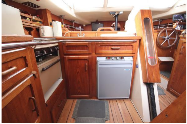
Southerly 105 galley