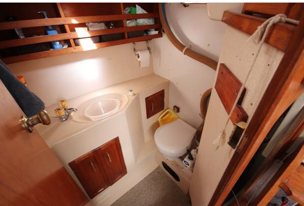
Southerly 105 heads