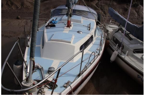
Colvic Sailer 26 on her berth