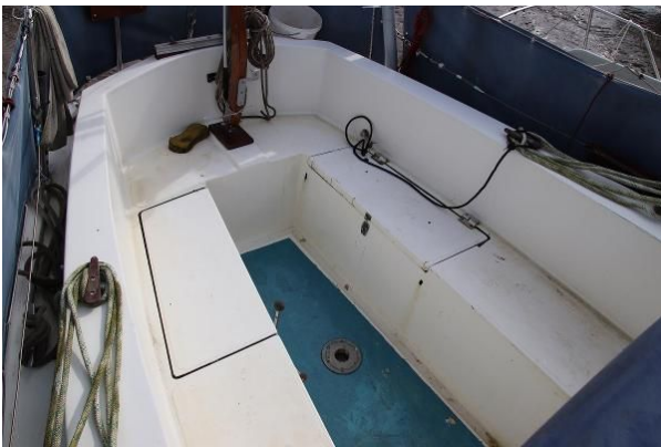
Colvic Sailer 26 cockpit