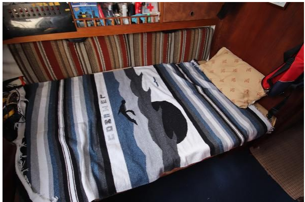
Colvic Sailer 26 double berth made up