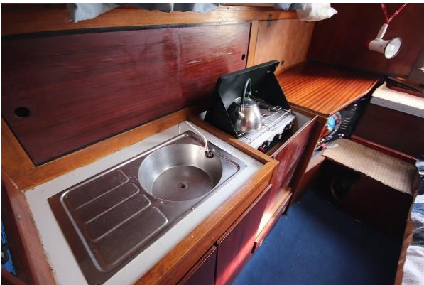
Colvic Sailer 26 galley