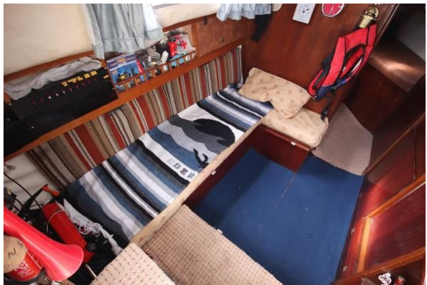
Colvic Sailer 26 saloon