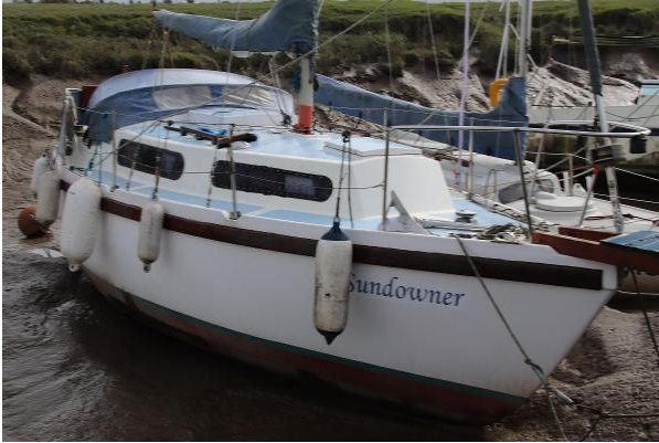
Colvic Sailer 26 takes the ground