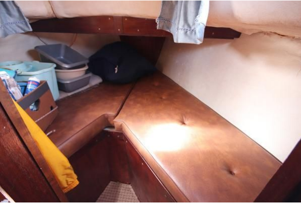
Colvic Sailer 26 forecabin