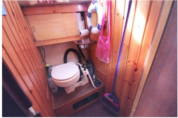
Colvic Sailer 26 heads