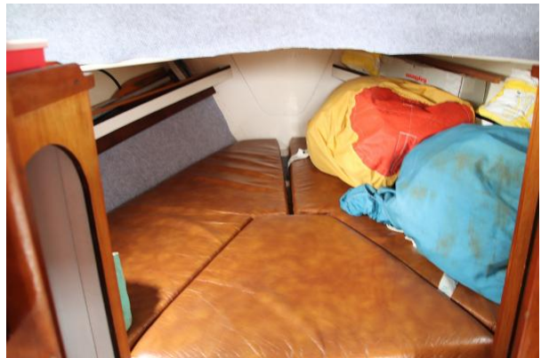
Macwester 27 forecabin