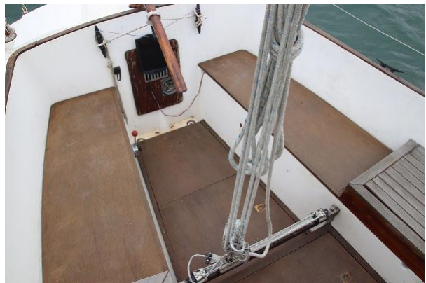
Macwester 27 cockpit