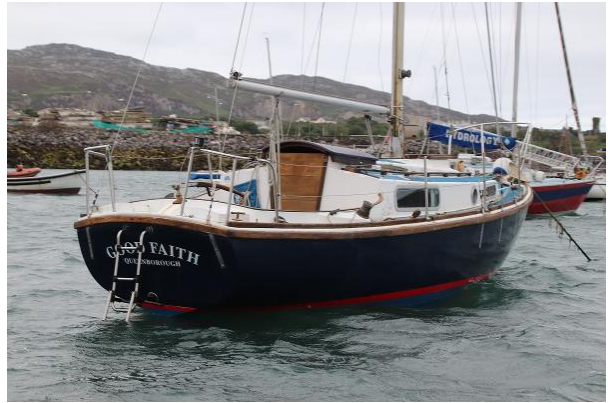
Macwester 27 Good Faith