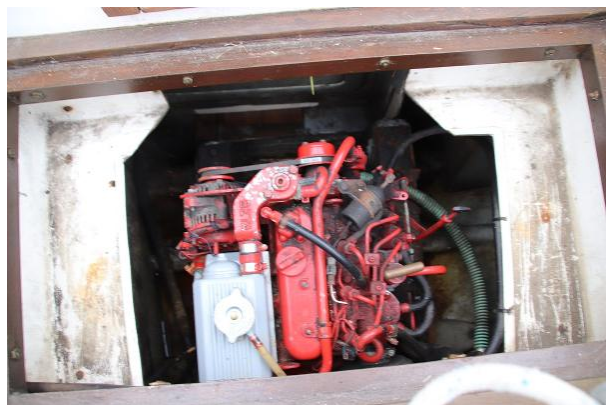
Macwester 27 Beta engine