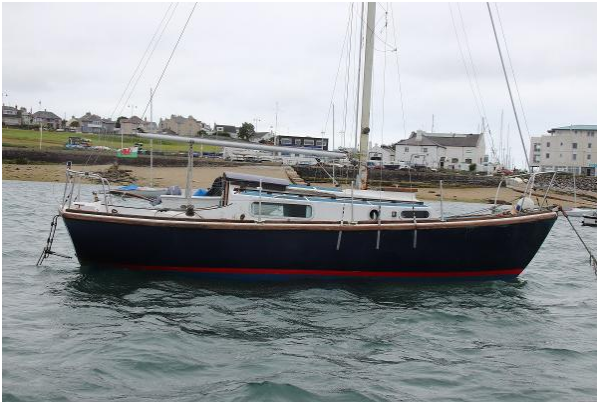
Macwester 27 on her mooring