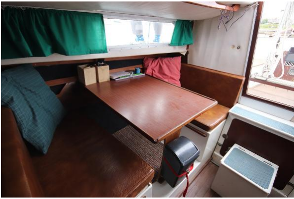
Macwester 27 dinette