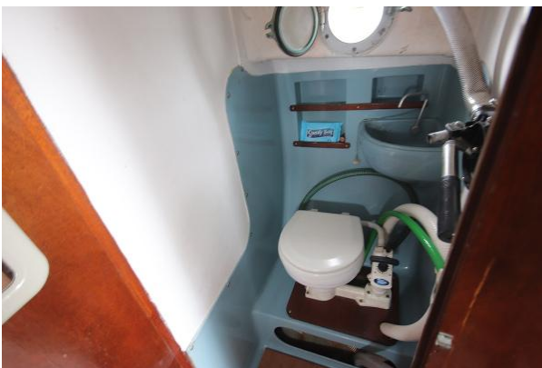
Macwester 27 heads