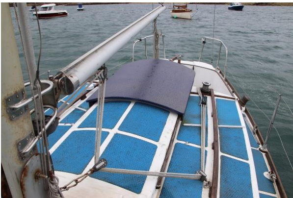
Macwester 27 looking aft