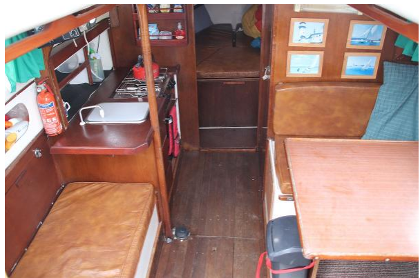
Macwester 27 saloon