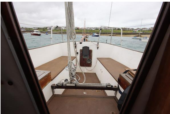
Macwester 27 cockpit from main hatch