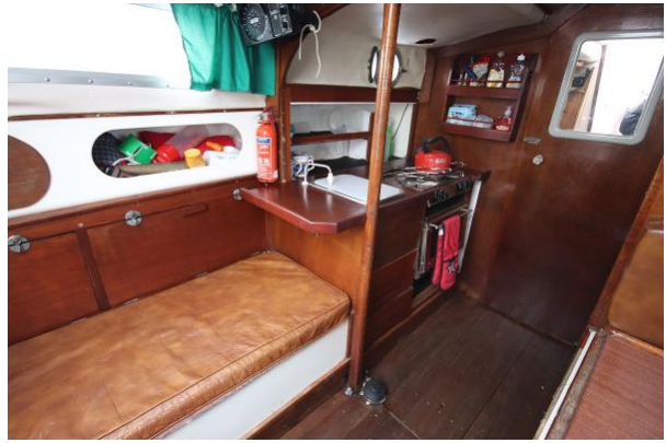
Macwester 27 seating to port