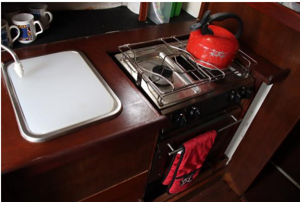
Macwester 27 galley to port