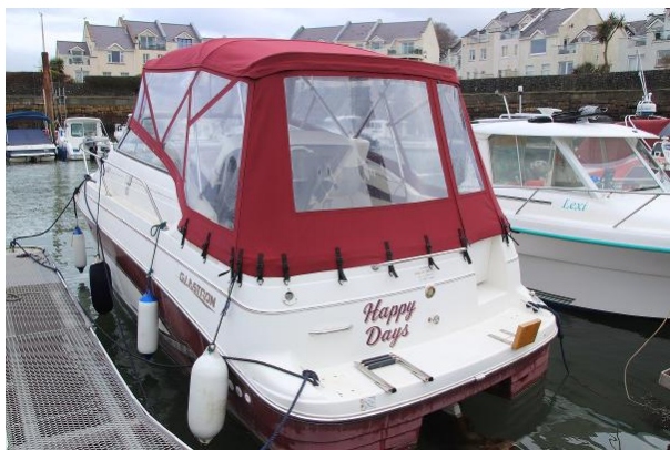
Glastron GS249 bathing platform