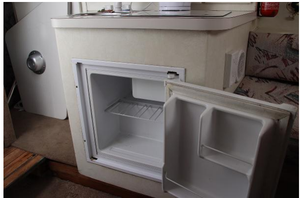
Glastron GS249 fridge