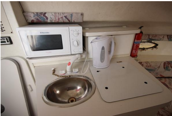
Glastron GS249 galley