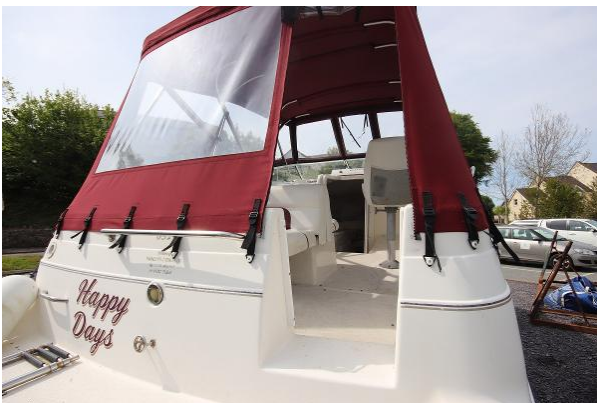
Glastron GS249 stern gate