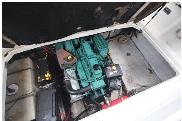
Glastron GS249 accessible engine