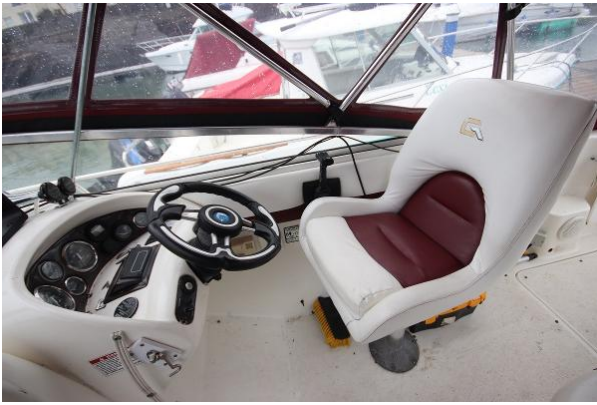
Glastron GS249 helm position