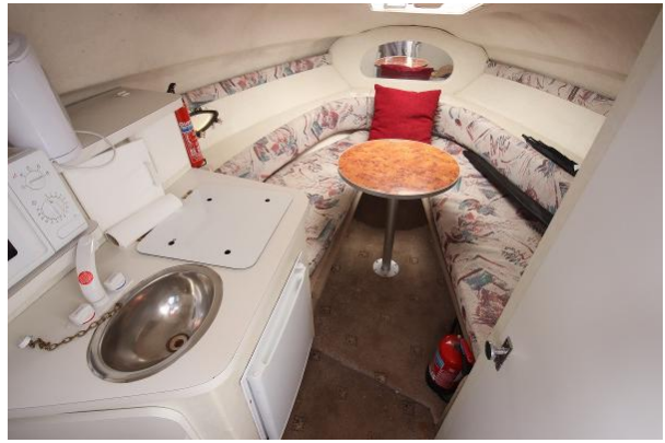
Glastron GS249 saloon area