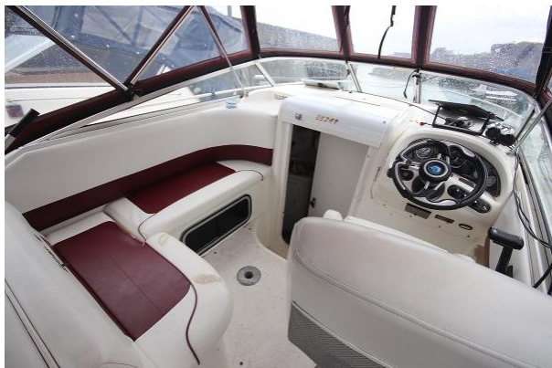
Glastron GS249 cockpit