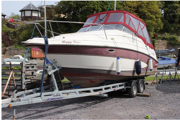
Glastron GS249 on the hard