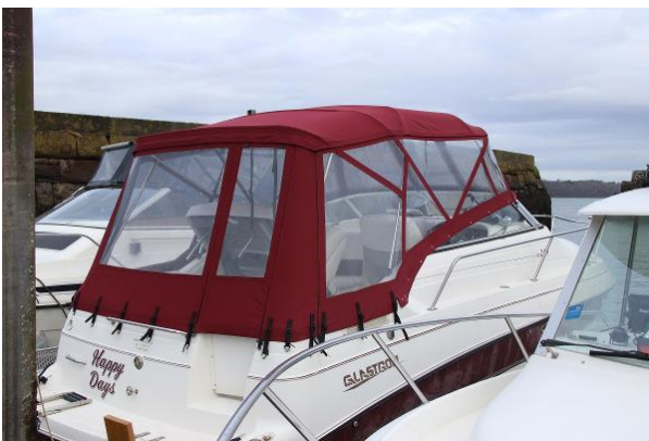
Glastron GS249 cockpit cover