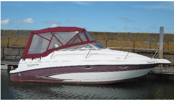
Glastron GS249 on her berth